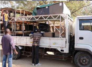
School tables , chairs and filing cabinets and a wood planer and much more a part of a UK Container .. Thank you St. Peters for your part and our amazing Tiyamike Mulungu Center UK Team !!!