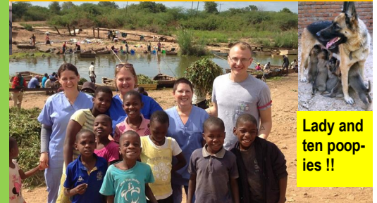
Lady and ten poopies !!