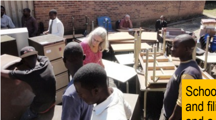
School tables , chairs and filing cabinets and a wood planer and much more a part of a UK Container .. Thank you St. Peters for your part and our amazing Tiyamike Mulungu Center UK Team !!!