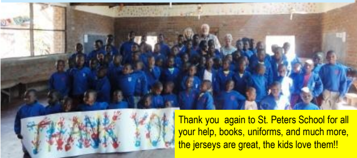
Thank you again to St. Peters School for all your help, books, uniforms, and much more, the jerseys are great, the kids love them!!