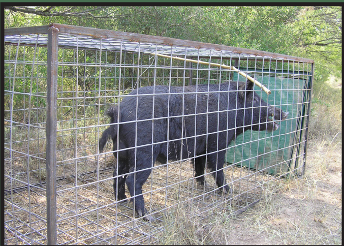
Figure 3. Feral hog captured in a box trap.

snare hogs should have a valid Texas hunting license, since these activities could affect other wildlife species.