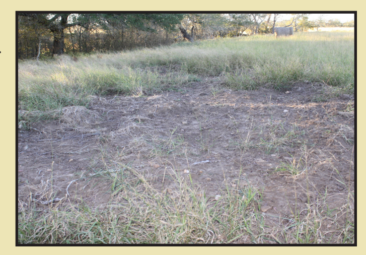
Figure 1. Damage to pasture from rooting by feral hogs.

Landowners or their agents are allowed to kill feral hogs on their property without a hunting license if feral hogs are causing damage. However, any landowner that plans to trap or