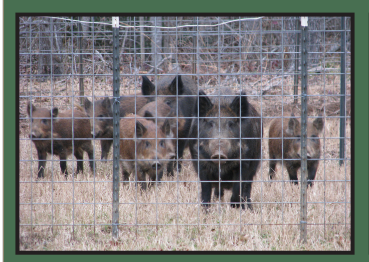
Figure 2. Feral hogs captured in a corral trap.