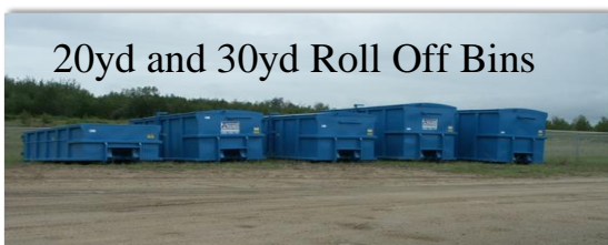
20yd and 30yd Roll Off Bins

**NEED ROLL OFF BIN SERVICE? Bin Services are ideal for: Renovations, Spring Clean-up, Roofing, Estate Clean-up, Yard Waste and almost anything else you can think of . . .