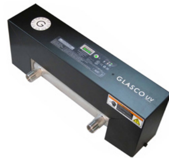
“The Classic Plus”