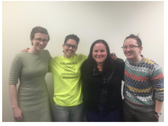
The Known Donor Project team hanging out on a Friday morning!

As mentioned in our last newsletter, seven graduate students at the Smith School for Social Work are writing their MSW theses on findings from the Known Donor Project. Topics include the influence of state and national policy on LBQ women's families, how crisis or conflict may impact donor-parent relationships, known donor families and the medical system, clinician-family relationships, and bioethical questions that known donor families consider.