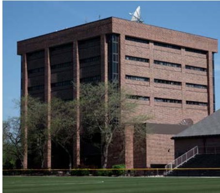
Cunningham Hall 1921 E. Hartford Ave Milwaukee, WI 53201

Cunningham Hall, home to the University of Wisconsin–Milwaukee College of Nursing, is located on the west side of campus on the corner of E. Hartford Avenue and N. Cramer Street.