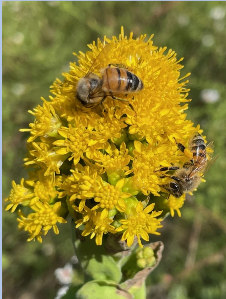
September 24 – Stiff Goldenrod ( Solidago rigida ), Berryton, KS – C. Burkhead