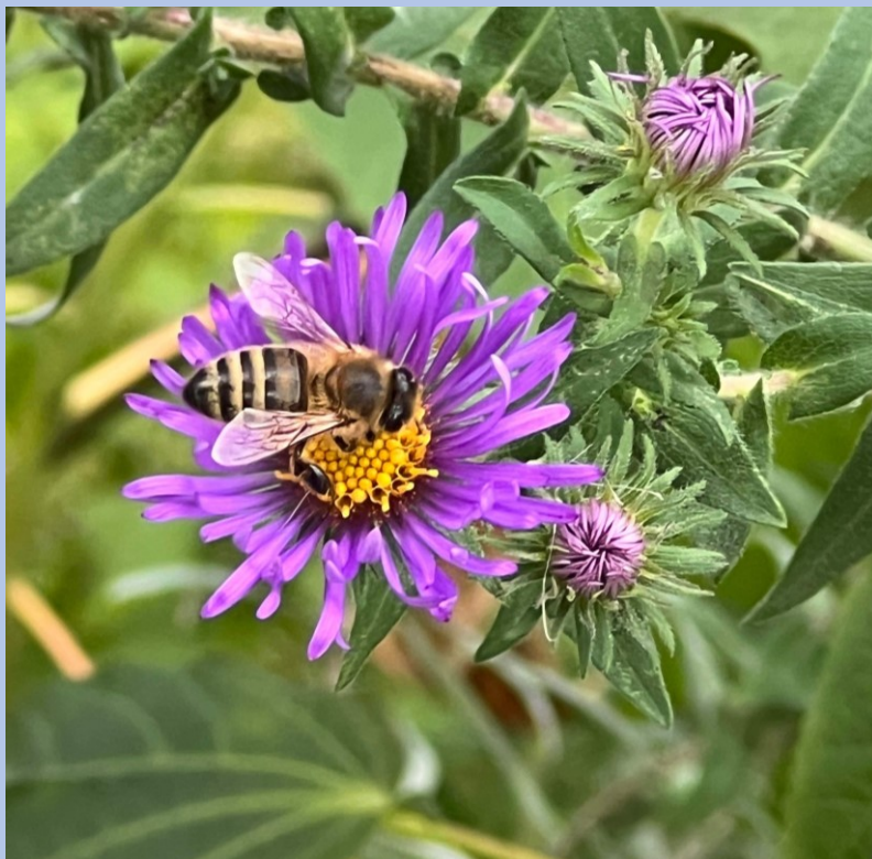
September 23 – New England aster, Auburn, KS – S. Lane