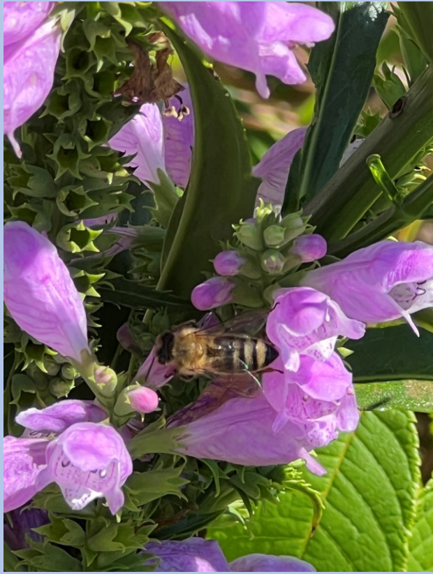
September 25 – Obedient Plant, Auburn, KS – S. Lane