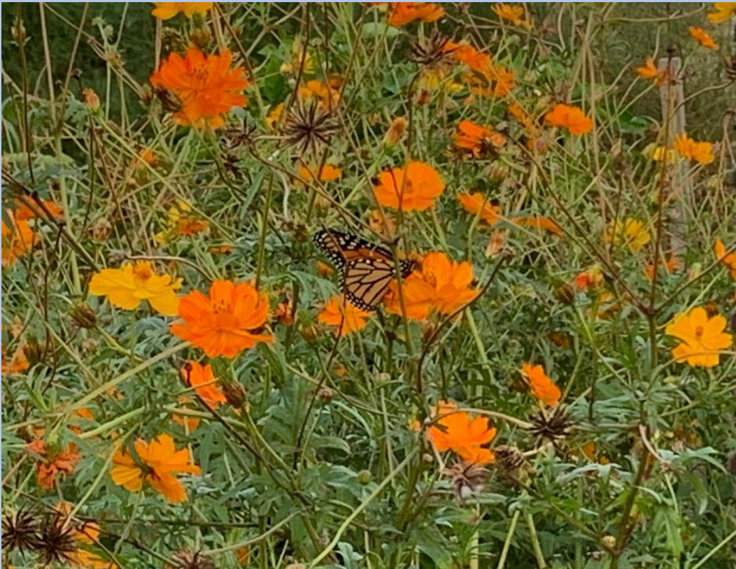
September 28 – Cosmos, DeSoto, KS – B. Warnes