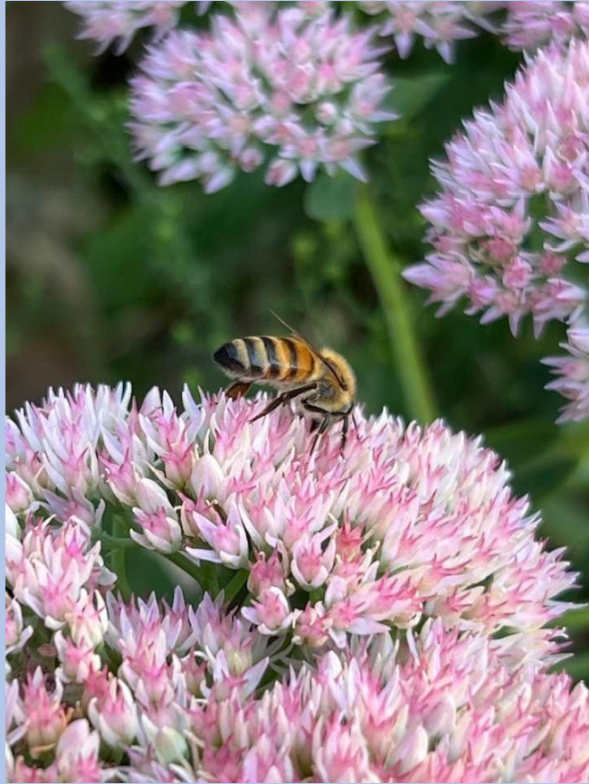
September 9 – Sedum, Auburn, KS – S. Lane