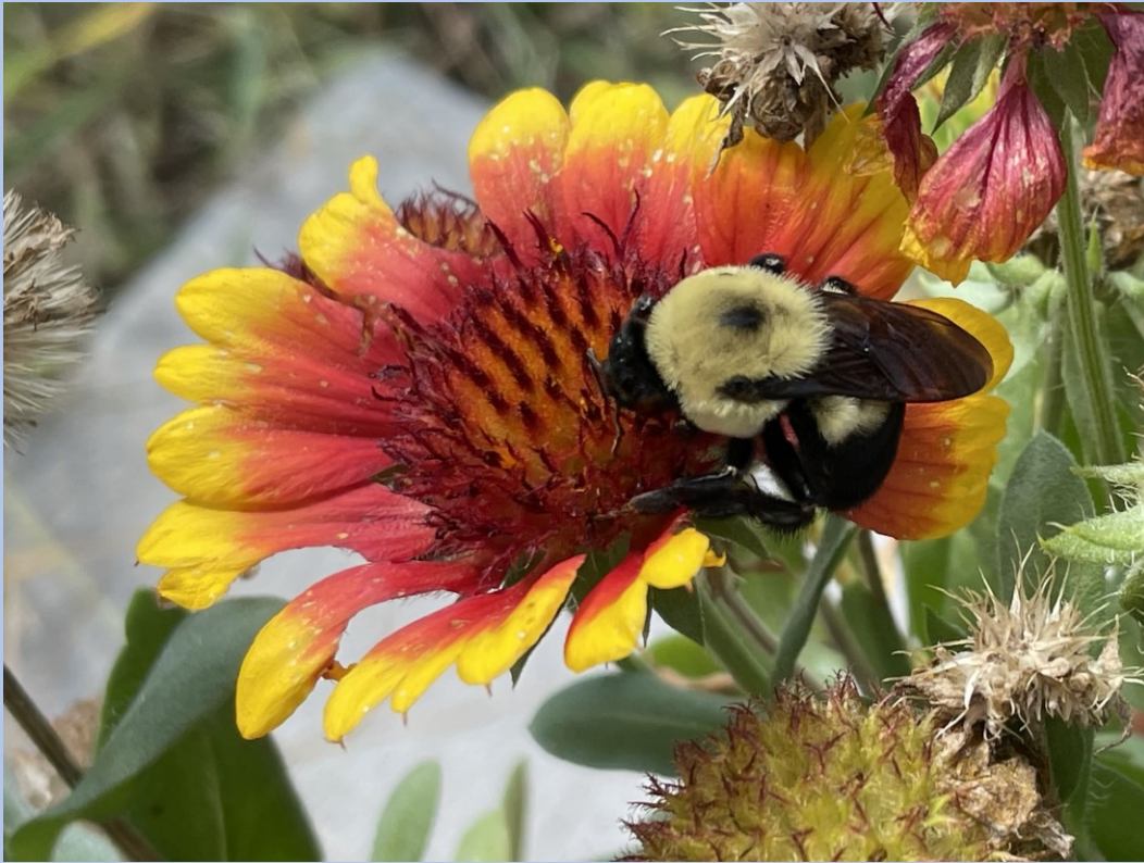
September 26 – Indian Blanket (Gaillardia), Berryton, KS – C. Burkhead