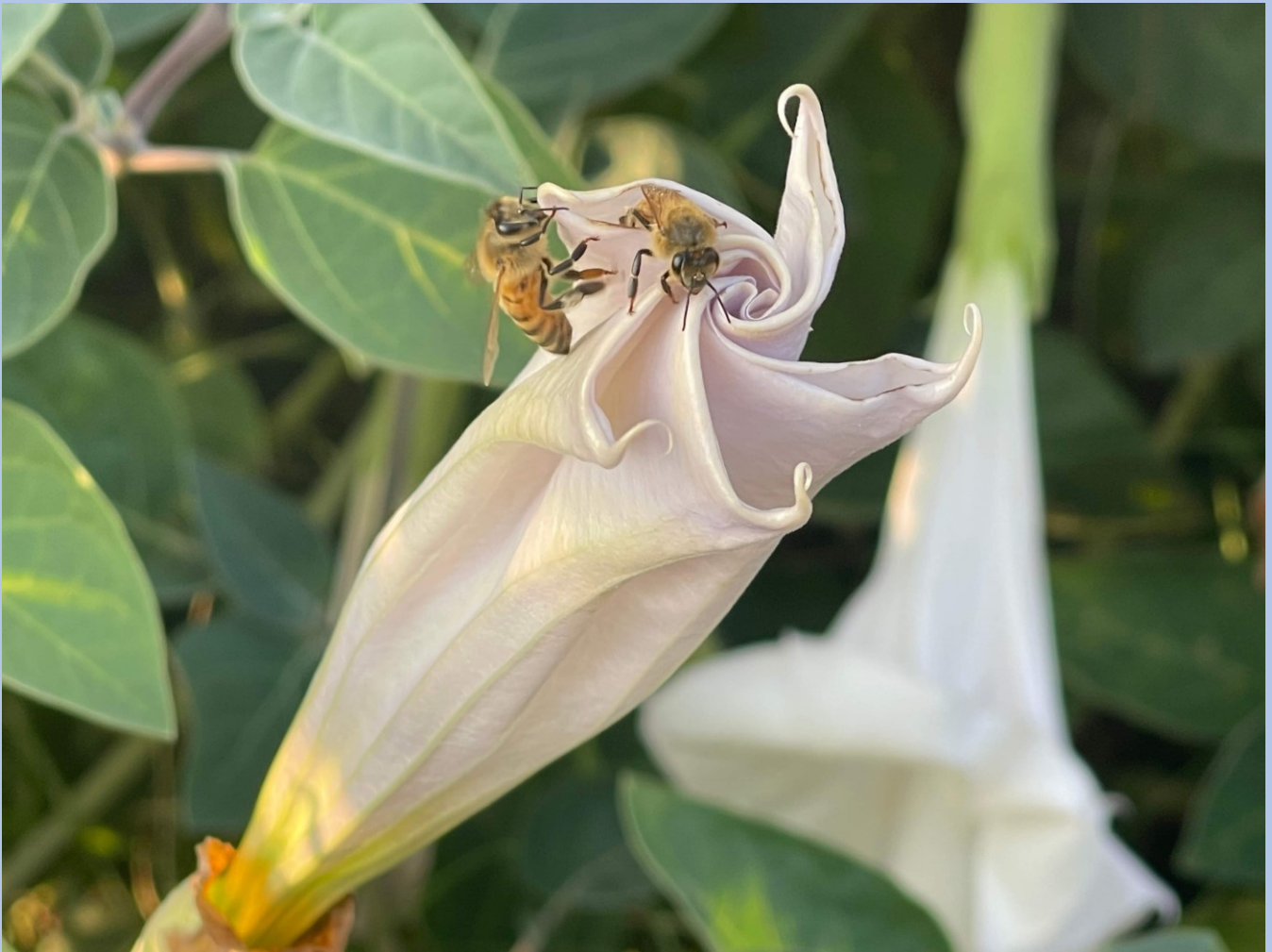
September 17 – Moon Flower ( Datura ), Merriam, KS – R. Burns