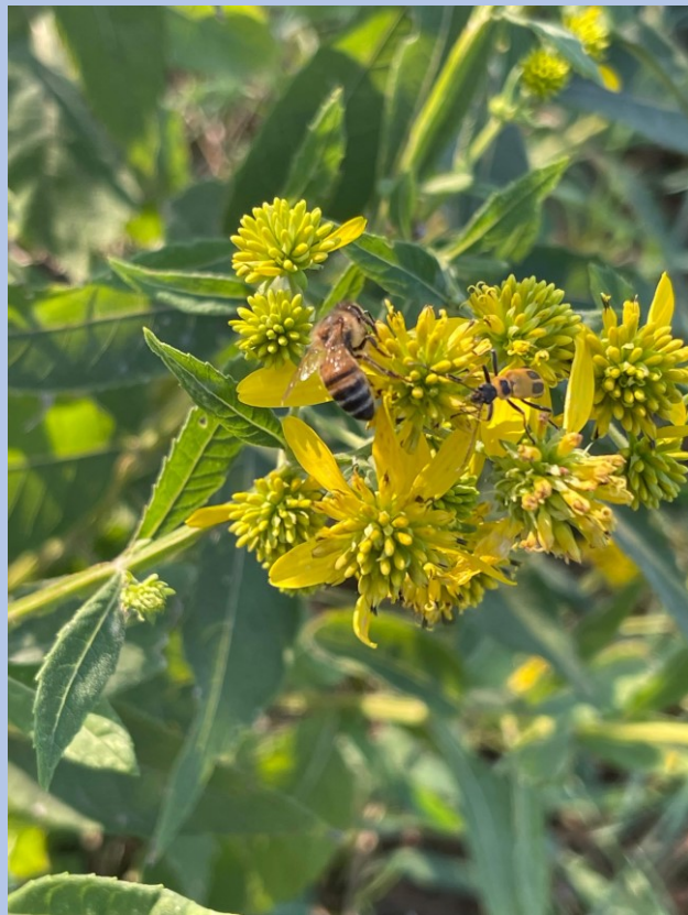
September 17 – Wingstem, KC, MO – R. Burns