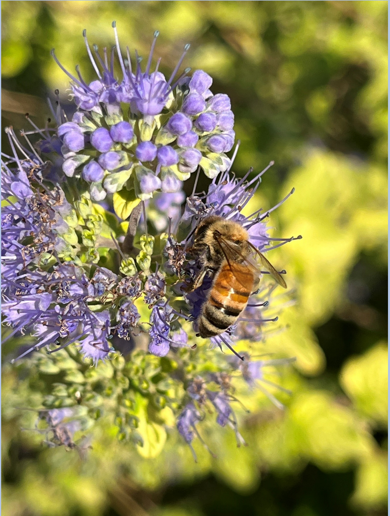
September 28 – Bluebeard ( Caryopteris ), Olathe, KS – K. Sanderson