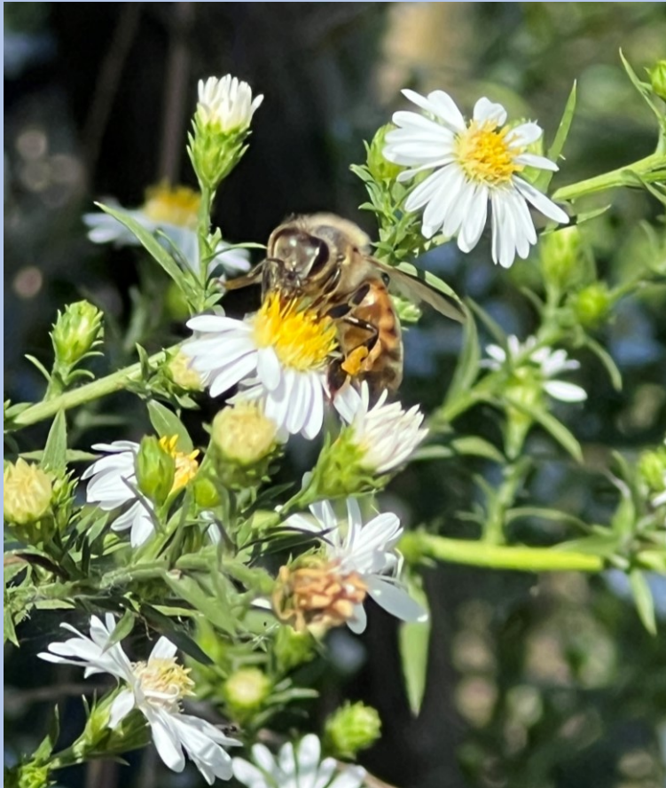
September 26 – Heath aster, Auburn, KS