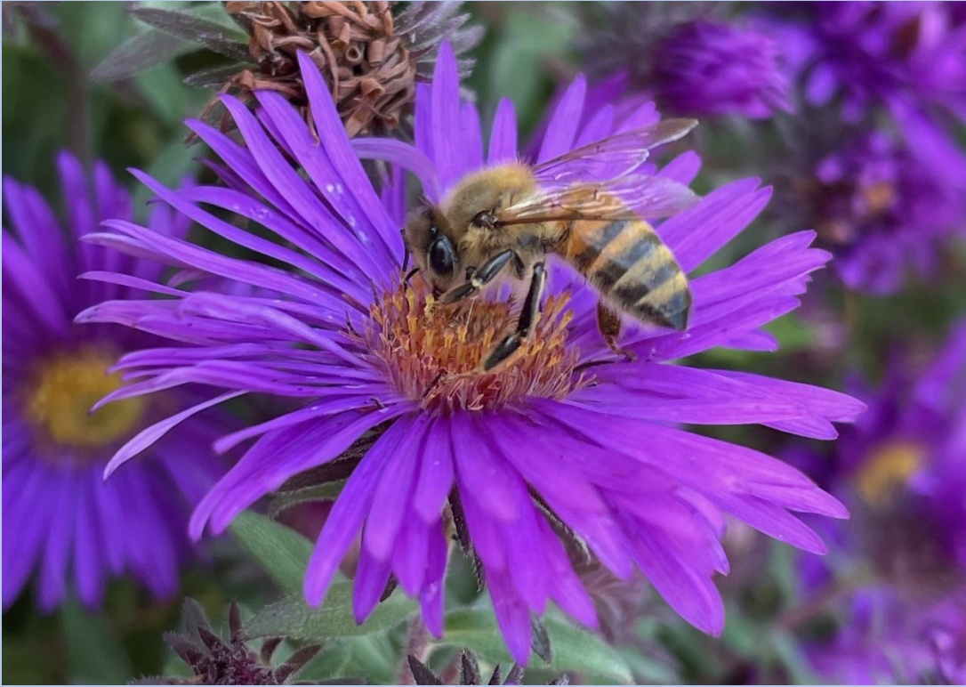
September 24 – New England aster, Berryton, KS – C. Burkhead