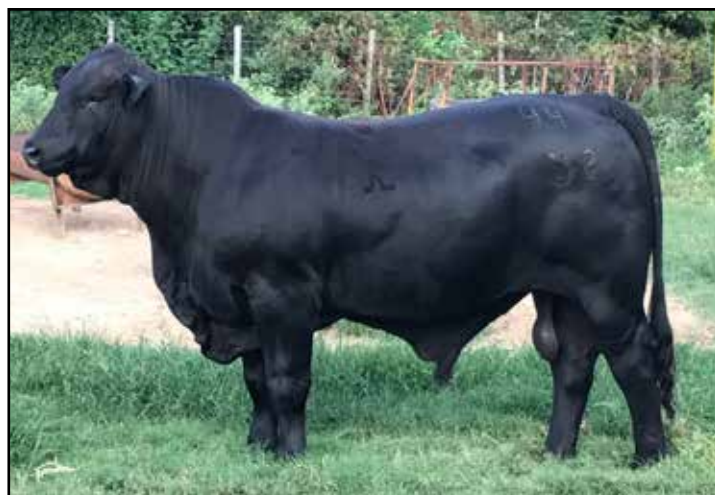
MR. RUDY 44D2

COULD VERY WELL BE ONE OF THE BEST 445 SONS TO SELL. STRONG TOPPED AND ATTRACTIVE SON OF SWAGGER 52W3.