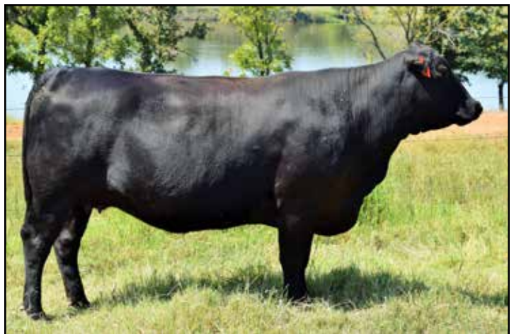
LOT 61: VOREL MS X FACTOR 909B3

GGPLD HERES A PRETTY NEAT DEAL. AN XFACTOR DAUGHTER OUT OF OUR DONOR VOREL MS BT 909S3. IMF IN TOP 2 % AND EXCELLENT FERTILITY AND SOUNDNESS. BRED TO TRADITION THIS MATING SHOULD PROVE TO BE PRETTY NEAT. AI'ed to CB TRADITION 63A ON 4/14/2017. EXPECTED TO CALVE TO CB TRADITION 63A.