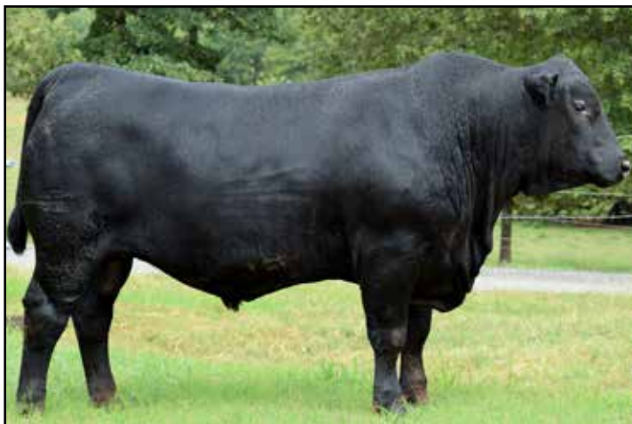
VOREL APP 361D61

GGPLD WE'VE WORKED HARD TO PRODUCE MULTI GENERATIONAL CALVING EASE CATTLE. THIS BULL WILL DO THAT PLUS GROWTH. HE SHOULD SIRE CATTLE WITH THAT PHENOTYPE THAT CATCHES EVERYONES EYE. THE 361 COW FAMILY JUST DOES EVERYTHING RIGHT. LOOK HIM UP. HES PRETTY NEAT WITH A CLEAN, PERFECT DESIGNED SHEATH, LOTS OF MUSCLE AND SUPER SOUND. PARENT VERIFIED SIRE & DAM THRU DNA TESTING