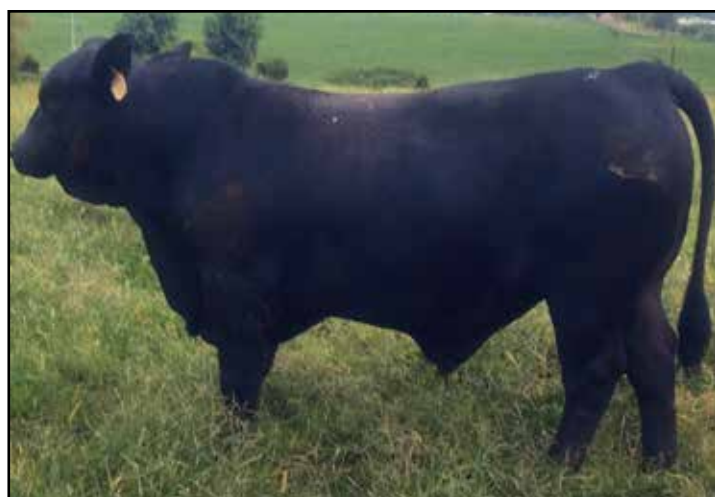
RCR CSONKA 08D

THIS BULL HAS PERFORMED AT THE TOP OF HIS CONTEMPORARIES WITH NO CREEP. HIS SIRE & DAM HAVE BEEN CONSISTENT PRODUCERS. HE COMBINES REAL PERFORMANCE AND GREAT CARCASS SCAN DATA