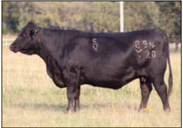
SCC MISS MENARD 894Y20

ULTRABLACK COW THAT DOES EVERYTHING RIGHT. SHE IS A LOW BW COW THAT IS A DEFINITE CARCASS IMPROVER.