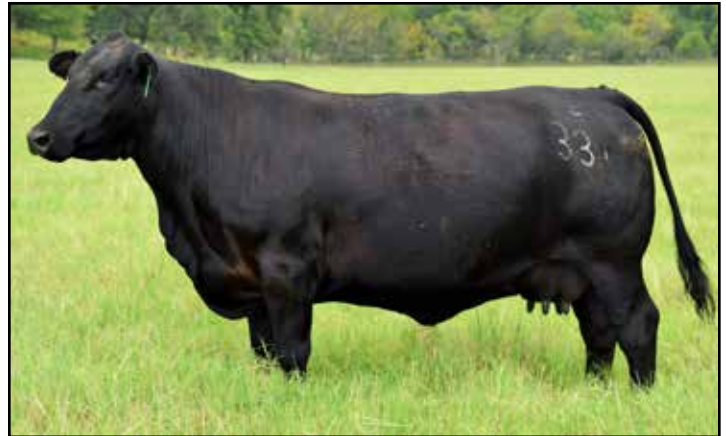
VOREL MS ALYDAR 331X

GGPLD HERES AN ALYDAR FEMALE IN HER PRIME. SHES AN EXCELLENT CALF RAISER. WE RETAINED A SPECIAL TRADITION DAUGHTER OUT OF HER SO HERES YOUR CHANCE TO OWN A 331 COW FAMILY. Aied to VOREL APP 25B 6/9/2017. CONFIRMED PREGNANT AND EXPECTED TO CALF TO VOREL APP.