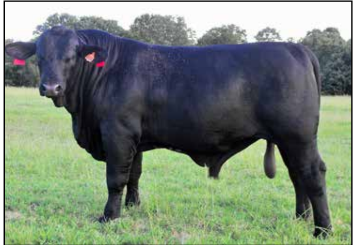
3PR CONSTANTINE 602

AN OUTSTANDING CORONADO SON JUST LIKE HIS DAD, LOW BW. GREAT EPDS, LARGE FRAME AND HEAVY MUSCLE. DON'T PASS ON THIS ONE.