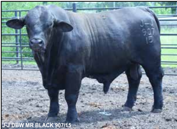
J-J DBW MR BLACK 907/15

MR. BLACK 14/15B IS A WELL BALANCED TWO YEAR OLD BULL WITH A NICE UNDERLINE, GOOD BONE AND THICKNESS. ACTUAL BIRTH WEIGHT OF 68 POUNDS. EXACTO AND DESIGNER ON THE DAM SIDE AND BLACK JET ON THE SIRE SIDE. GREAT DISPOSITION.