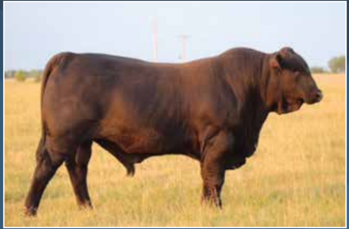
117D | ULTRABLACK VOREL OPTION 918Z3 SON. SUPER SOUND, THICK AND FULL OF MUSCLE