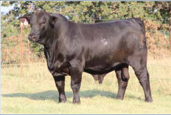
410D | BLACK JET X SUHN CUTRIGHT A TOTAL PACKAGE, EYE APPEAL, CALVING EASE AND GROWTH