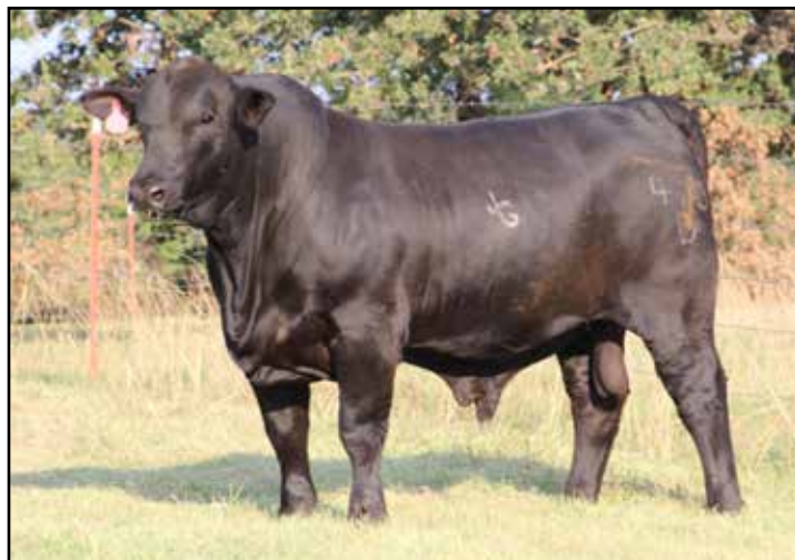
JG MR. 410D JET

WHEN LOOKING FOR A HERD SIRE THAT HAS THE APPEARANCE YOU WANT CHECK THIS GUY OUT. HE IS NEARLY FLAWLESS FROM HOOKS TO PINS, THEN GAZE OVER HIS TOP AND ADMIRE THE LONG CLEAN FRONT END. LOOK AT HIS EPDS. HE HAS A 0.2 BW EPD AND A 1249 ACTUAL YEARLING WEIGHT.