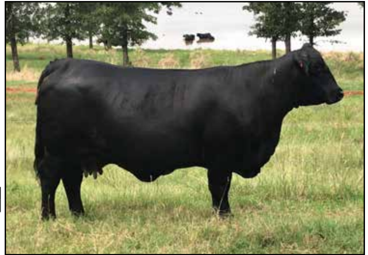
361Z2: DAUGHTER OF 361X2 AND SISTER TO 361E7.

GGPLD THIS DISTINCTION DAUGHTER HAS DONE AN EXCELLENT JOB FOR US. SHE IS THE DAM OF THE FANCY APP HEIFER AS LOT 58 AND PRODUCED A DONOR DAM VOREL MS ONSTAR 361Z2 FOR US. 361Z2 IS THE DAM OF ONE OF THE VERY POPULAR FOUNDATION SON'S WHO SOLD SPRING OF 2017 AT SUHN'S. 361X2 IS ONE TO TAKE HOME AND BUILD AROUND SHE WAS AI'ed TO VOREL APP 25B ON 7/8/2017 AND CONFIRMED PREGNANT - EXPECTED TO CALVE TO VOREL APP.