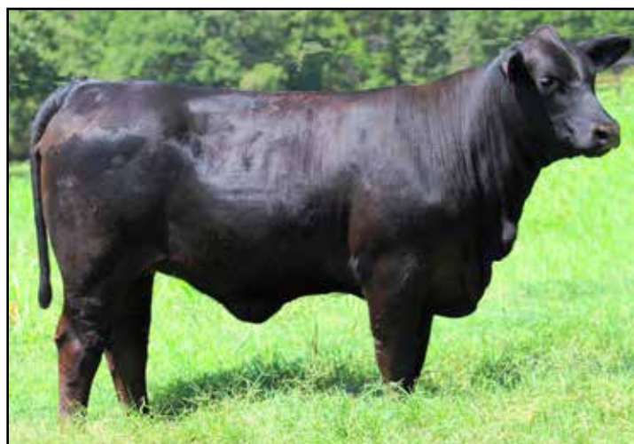
JG MISS 804/D1 JET

WHEN LOOKING FOR A FEMALE WITH A PURPLE RIBBON PEDIGREE CHECK THIS ONE OUT AS SHE CONTAINS 747 BLACK JET ON THE SIRE SIDE AND 804 FROM DOGUET'S HERD ON THE DAM SIDE. IF THIS ISN'T ENOUGH SHE WAS AI ON 6-13-2017 TO RCC TITLEIST AND CONFIRMED SAFE IN CALF. TITLEIST WAS THE 2015 SHOW BULL OF THE YEAR.