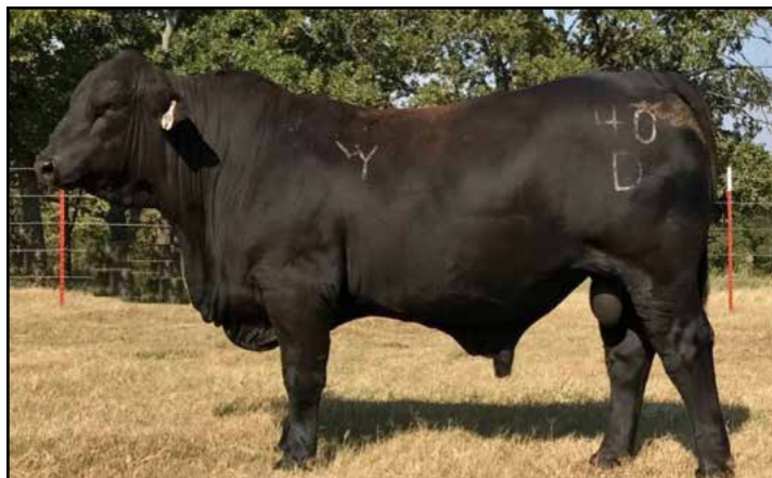
YLC BOULDER 40D

GGPLD 40D IS AN OUTSTANDING SIRE PROSPECT. HE HAS 7 TRAITS IN THE TOP 20% OF BREED WITH A TOP 4% RANKING IN IMF. A GROWTH AND CARCASS BULL THAT STARTED LIFE AT 69 POUNDS.