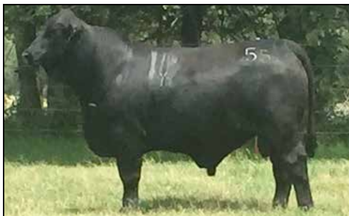
YLC BOULDER 55D

GGPLD 55D IS A LOW BIRTH WEIGHT SIRE PROSPECT STARTING LIFE OUT AT AN ACTUAL 55 POUNDS. HE RECORDS A PHENOMENAL 10 TRAITS IN THE TOP 40% OF THE BREED. A VERY EASY FLESHING, DOCILE PROSPECT WITH EXCELLENT PHENOTYPE.