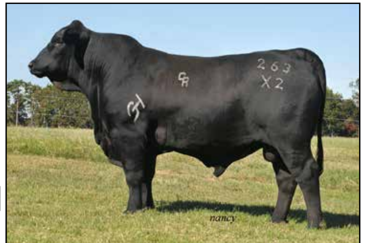
CRC LANDAU 263X2

GGPLD HERE IS A LANDAU SON THAT IS REALLY DEEP FLANKED AND STOUT MADE BULL. HE IS A CALVING EASE LOW BIRTH WEIGHT BULL. HE RANKED TOP 40% IN SEVERAL CATEGORIES ON EPDS. HE HAS BEEN PARENT VERIFIED THROUGH DNA TESTING.