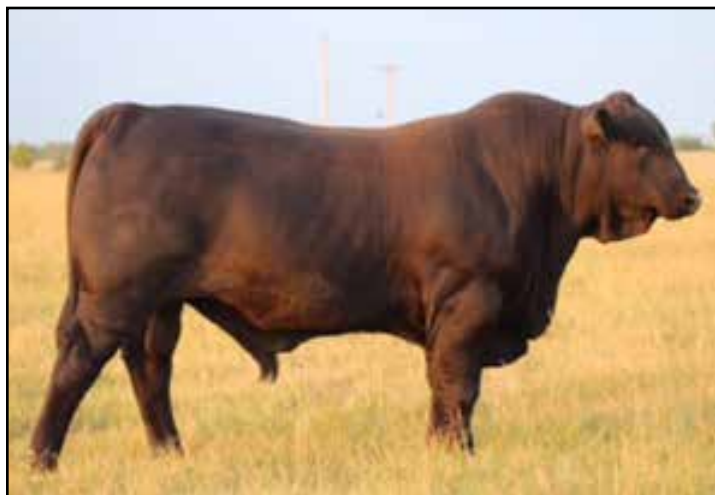
LAWMAN OPTION 117D

GGPLD ULTRABLACK OPTION SON. SUPER SOUND. THICK AND FULL OF MUSCLE. CURVE BENDER TYPE GENETICS.