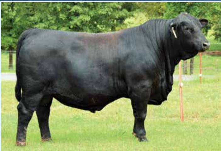
909D16 | VOREL APP 25B X ONSTAR DAUGHTER CALVING EASE AT ITS BEST PLUS GREAT FEET, GROWTH AND MATERNAL