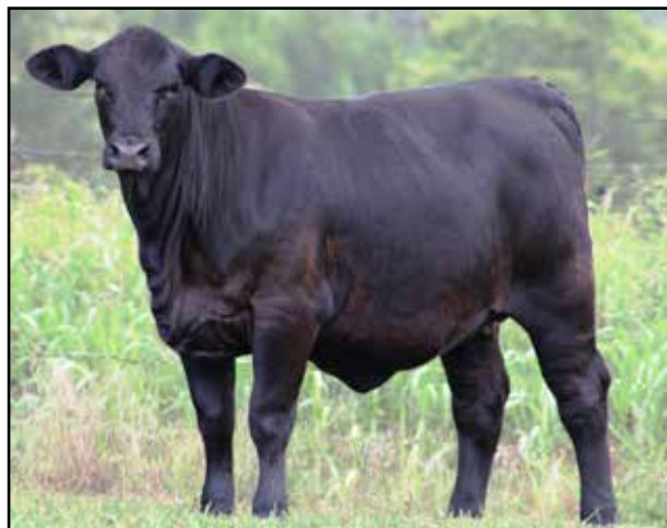
JG MISS 610 E GARRETT JET

BLACKHAWK OF BRINKS 607M12 TRANSFORMER OF BRINKS JG MR. 747 BLACK JET MISS BRINKS SUNDANCE 607K18 R10095245 JG MISS SATURN STAR CPPR SATURN 854 DONICA 7W GARRETT OF BRINKS 789P BEST BET OF BRINKS 535H38 LG ELBA 5/4-6/10 MS BRINKS ALI 789M R10184102 LG ELBA 21/0-5/4 RWR MR TRANSFORMER 21H2 LG ELBA 2/2-21/0