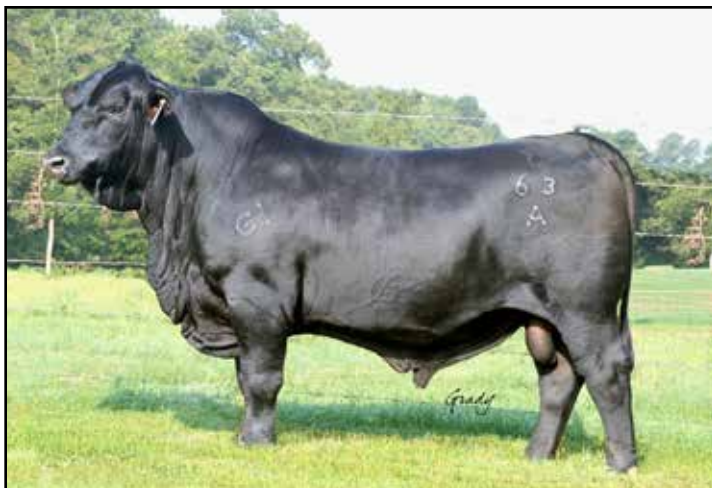
CB TRADITION 63A

GGPLD UNIQUE PEDIGREE TRADITION OUT OF A 1ST GENERATION SAV 004 DAUGHTER. HES SUPER SOUND, BIG FULL BODIED, AND SHOULD PRODUCE CALVES THAT COME EASY, GROW FAST AND DAUGHTERS MAKE SUPER PRODUCTIVE COWS THAT LAST MANY YEARS. PARENT VERIFIED SIRE & DAM THRU DNA TESTING.