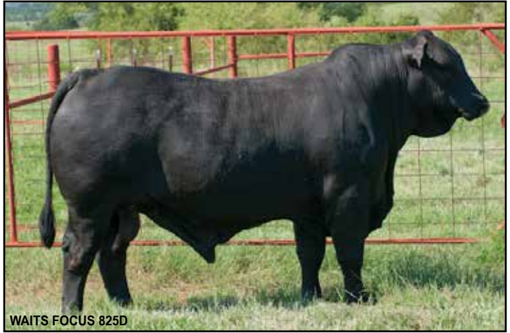
WAITS FOCUS 825D

R10317646 • 239D • P • GEN: 1 • 3/27/16 • AI • Bull • Waits