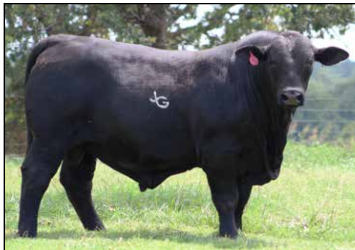
JG MR. 55D MVP

LOOKING FOR A BULL THAT WILL ADD SOME RED MEAT TO YOUR CATTLE CHECK THIS FELLOW OUT. HE IS DEEP BODIED, BIG TOPPED AND EASY FLESHING AS WELL AS HAVING A 1360 LB YEARLING WEIGHT. YOU WILL WANT TO KEEP THE HEIFERS OUT OF THIS GUY BACK IN YOUR HERD AS REPLACEMENTS.