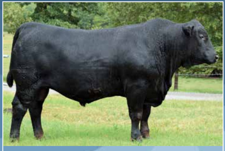
361D61 | VOREL APP 25B SON CALVING EASE PLUS GROWTH, CARCASS AND MATERNAL