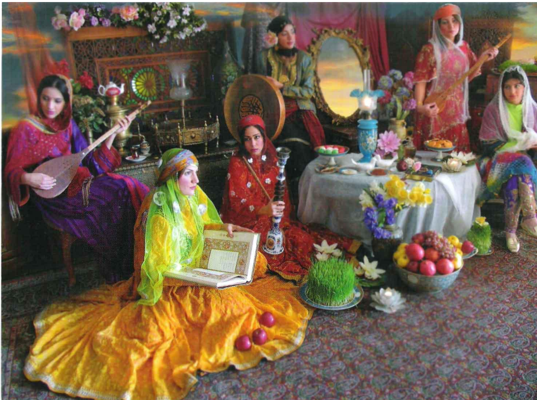
Iranian women in traditional dress celebrating Norooz. They are surrounded by special objects as well as herbs, spices, foods and plants with symbolic or sacred significance

The centerpiece of the Norooz celebration is the Haft-Seen , pictured below. Haft-Seen , or the Seven-S's ( Haft is "Seven" in Farsi and Seen is the letter "S" ) is a grouping of symbolic items all beginning with the letter "s" in Farsi, the Persian language. These symbols originated in the ancient Zoroastrian religion and are said to embody the seven "angelic heralds" of happiness, life/birth, joy, health, prosperity, patience, and beauty.