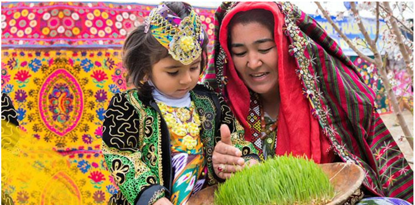
Norooz is widely celebrated throughout the areas of Central and Western Asia which were part of the ancient Persian Empire. Here, an Uzbek woman explains the significance of sprouted grain as a symbol of the cyclical renewal of life.

Within their own religious and cultural contexts, these Springtime festivals all celebrate the same underlying themes - the promise of new life, the triumph of light over darkness, and the ending of a time of deprivation or discord. In most of the world Spring festivals also coordinate the beginning of the agricultural cycle of cultivating, planting, and harvesting.