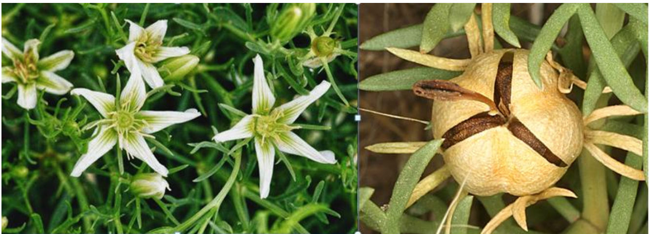
Syrian rue ( Peganum harmala ) is a hallucinogenic plant used in Tajikistan to drive out the evil spirits of winter

Fumigation with “sacred” smoke is another purification ritual performed on the eve of Norooz. In rural areas of Kyrgyzstan and Kazakhstan, for example, the smoke from juniper twigs is believed to frighten away any lurking malicious spirits. Syrian or wild rue ( Peganum harmala ) is similarly used to drive out evil and bad luck in Tajikistan.