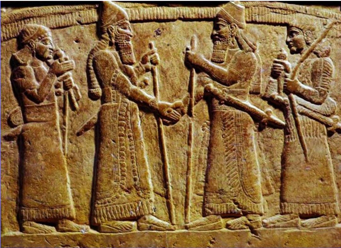
The Babylonian Spring festival was called Beginning of the Year and was associated with ritualistic demonstrations of sport for the chief Babylonian god Marduk

Their successors, the inhabitants of the Old Kingdom of Babylon (2000BC), also celebrated their New Year with the arrival of Spring.