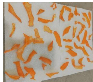
This is the dried peel of three oranges

https://www.youtube.com/watch?v=peiKl_F6GJO What I like about this video is that it shows a peeling process that gets all the zest but none of the pith. However, the woman in the video uses a dehydrator which is fine if you have one. Leaving the peel to dry on a plate or paper toweling until it is crisp and crunchy (about 5 days give or take) is fine too. You may not think that you have enough citrus to bother with, but if we add all our little bits together, it will truly amount to something!