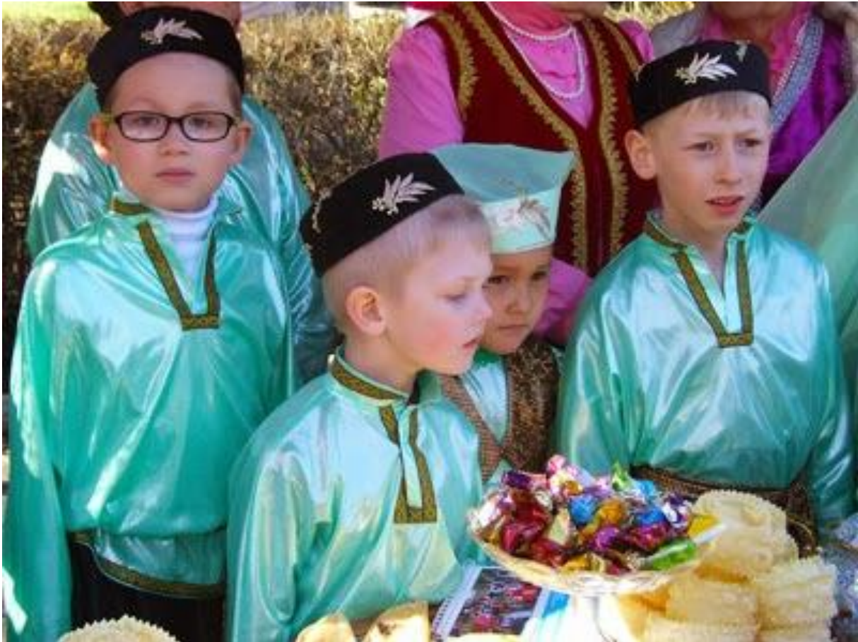
Children of the Tatar-Bashkir diaspora celebrating Norooz. The vast majority of Tatars today reside in post-Soviet countries, primarily in Russia, Ukraine and Uzbekistan. After a long period of persecution, they are once again allowed to celebrate Norooz.

While the fusion of Iranian and Mesopotamian beliefs was harmonious and creative, history has not always been as kind to all ethnic groups wishing to celebrate Norooz. The following images focus on ethnic groups whose history has been difficult: