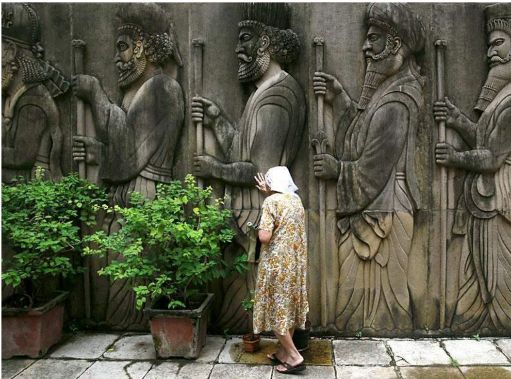
Many followers of the Zoroastrian religion fled from Persia to India following the Arab conquests - their descendants are Parsi , which means "Persian". This woman is praying at The Fire Temple in Mumbai, a pilgrimage performed by the Parsi community every Norooz.