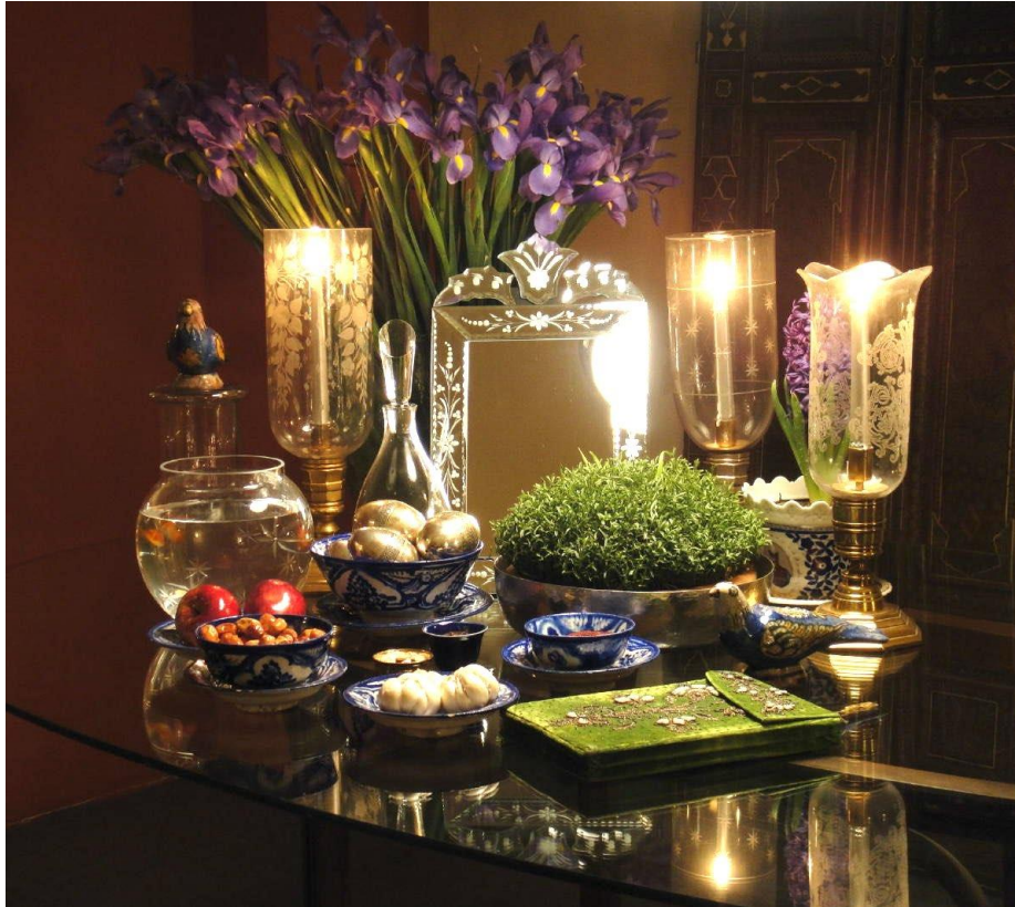
Candles and mirrors reflect the new light and new life of the season

Together, these seens are a visual reminder of what is necessary for successful renewal. Additional symbolic items vary by region and may also depend on family tradition. For instance, in Irani households, a volume of poetry by Hafiz, the fourteenth-century lyrical poet, is frequently added to honor their Persian heritage and to inspire learning. A holy book from the household's particular religion might also be given a prominent position on the Haft-Seen table.