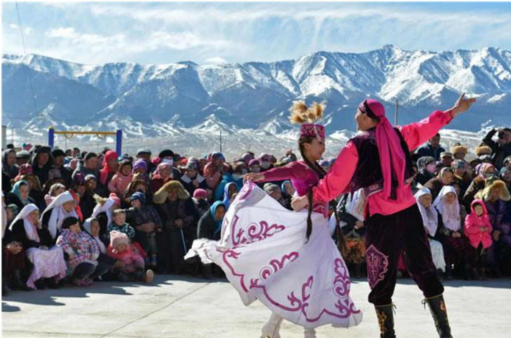
Kazakh villagers celebrating Norooz in the Uighur Autonomous Region of Xinjiang Province, China. During World War I and again during Soviet rule, these nomadic Asiatic Turkic-speaking people were persecuted. Many fled with their herds to Xinkiang Province in China where their freedoms are now being threatened again.