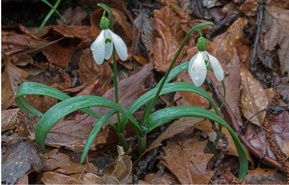
One of the earliest harbingers of spring, Galanthus transcaucasicus , or snowdrops, in the Hyrcanian forest of Azerbaijan near the southern Caspian Sea

As the year completed its annual cycle and settled into darkness, there was a great risk that our ancient ancestors would perish. The advent of spring was therefore particularly momentous - life was assured as the cold, deprivation, and depression of winter was replaced by the warmth of the returning sun, plentiful food, and a general feeling of exuberance.