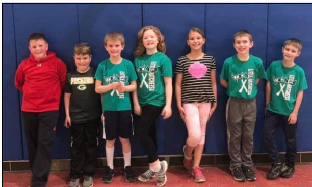
Little Hatchets Sports Club

Pictures from SCAN Little Hatchets, Uncork & UnWine, and Biggest Loser activities below and on page 5.