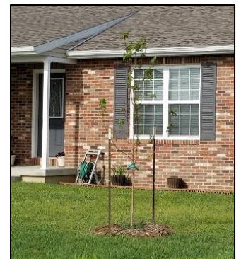
New tree in York Acres