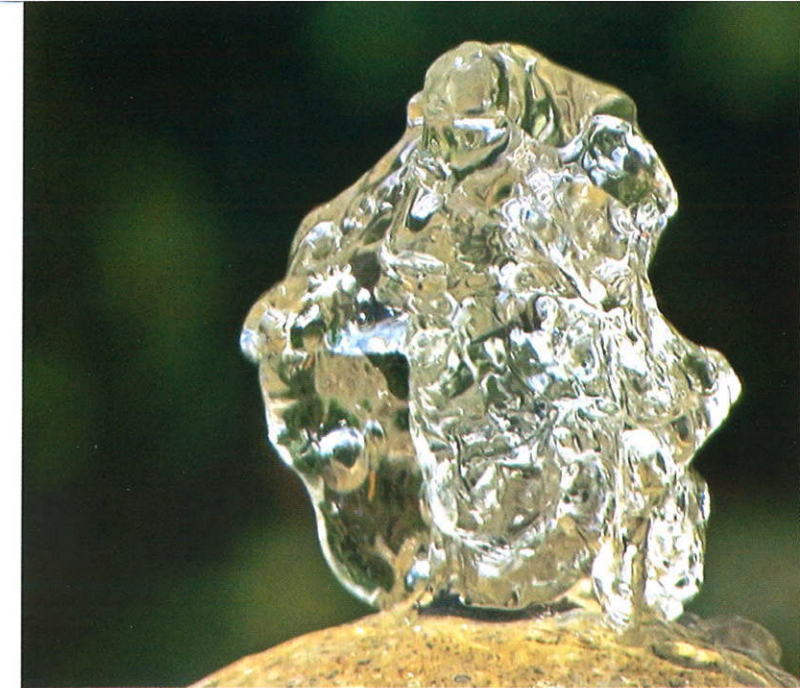
Fountain of Survival is a piece of art by Michele Geiser.

If you are further interested in Geiser's photography or are