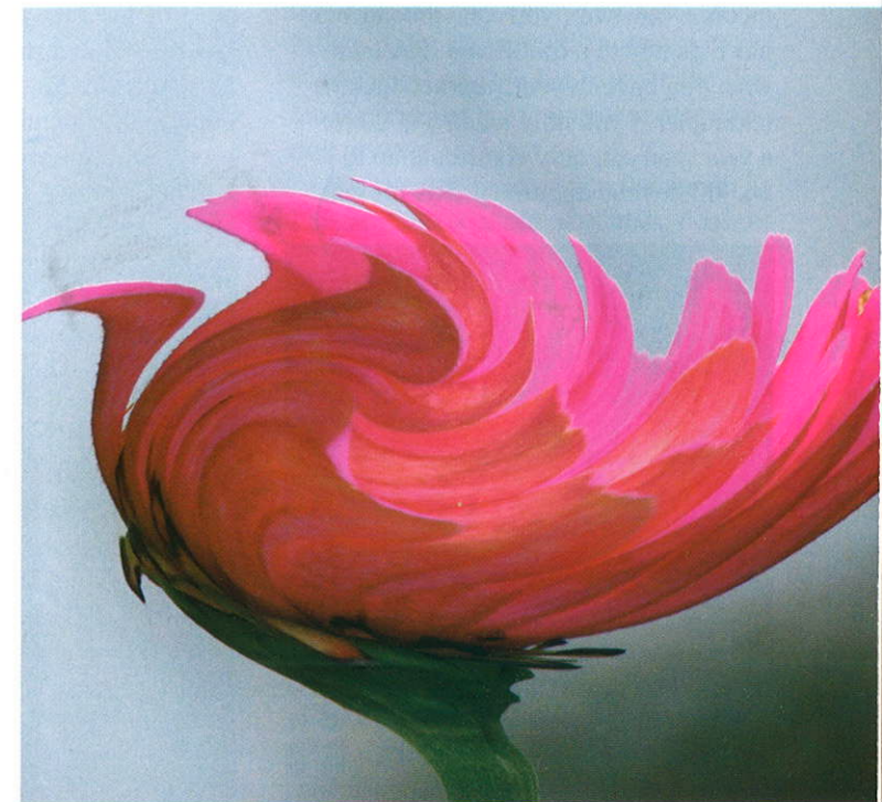
Twirl is a photograph by Michele Geiser. Photo courtesy of Priscilla Bonilla

looking for something specific, you can contact her for more photos. Specific nature shoots can be made by appointment.