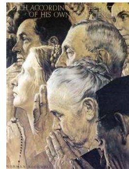
Freedom of Worship Norman Rockwell, 1943

Separation is a concept that sets one concept or institution apart from everything else. What could acknowledge the importance of separation more than the concept that we have unalienable rights endowed by our Creator and that, as such, those rights are untouchable and can’t be bought or sold – or denied, except through tyranny. The role of government is to protect that right. That right must not be manipulated or over-interpreted.