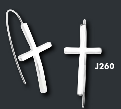
J260 • CURVED CROSS EARRINGS [pendientes] Elegant curved silver cross earrings with long curved hook backs. 1½"L. $16.00