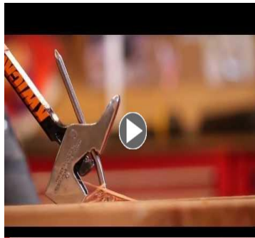
Quick Gripper Nail Puller