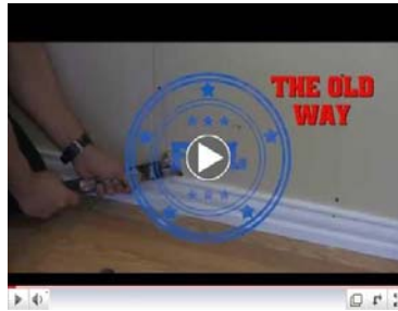
Zenith Trim Puller

I believe these are a must for every Restoration Technician.