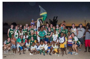
Fields of Growth - Jamaica January 2016

We would also like to acknowledge the PHS Girls' Lacrosse team for their annual fundraising effort for the AAF during their Girls' Lax Night with the youth program. And another thank you to the 2016 Boys' team and assorted alumni who came together in support of the AAF for a great alumni game.