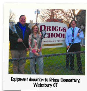
Equipment donation to Driggs Elementary, Waterbury CT