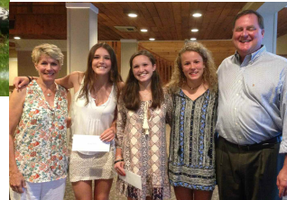
PHS Girls' Scholarship Recipients