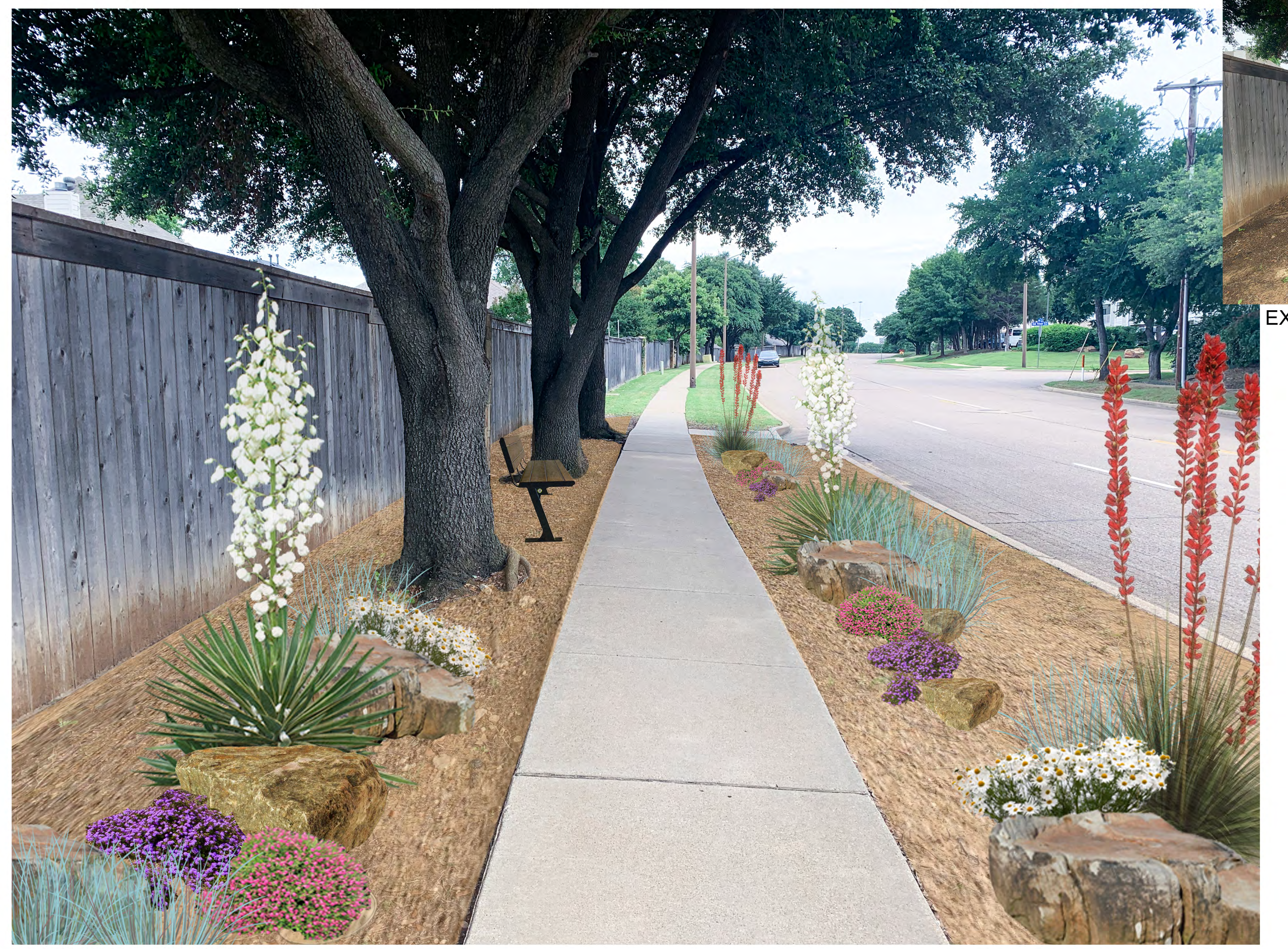
EXISTING SITE CONDITIONS