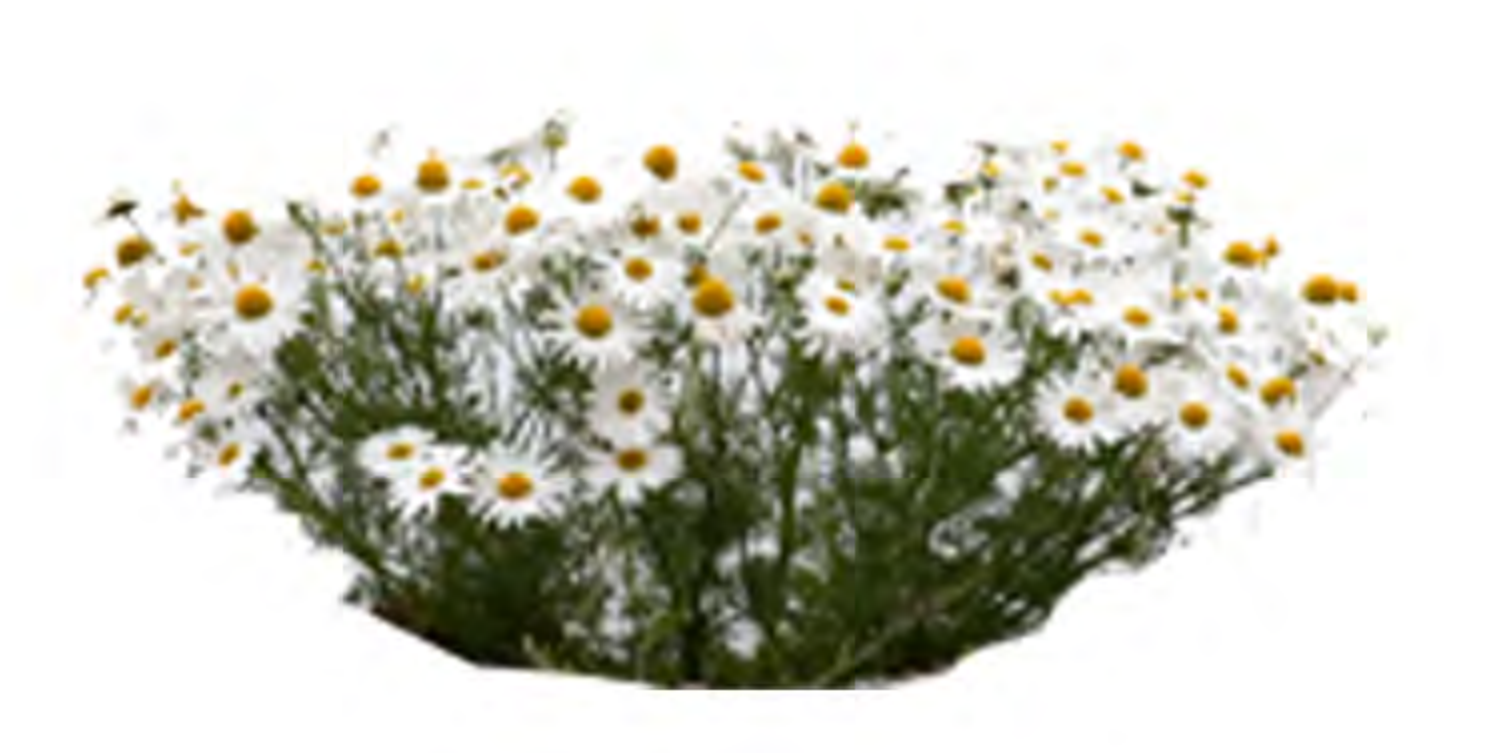
BLACKFOOT DAISY (MELAMPODIUM LEUCANTHUM)