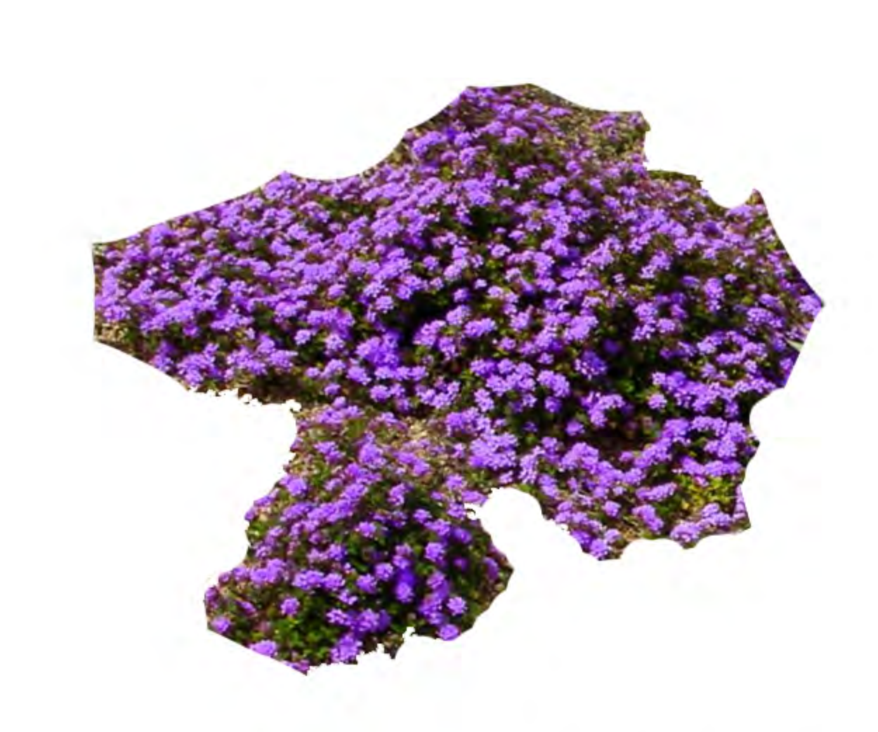
PURPLE TRAILING LANTANA (LANTANA MONTEVIDENSIS)