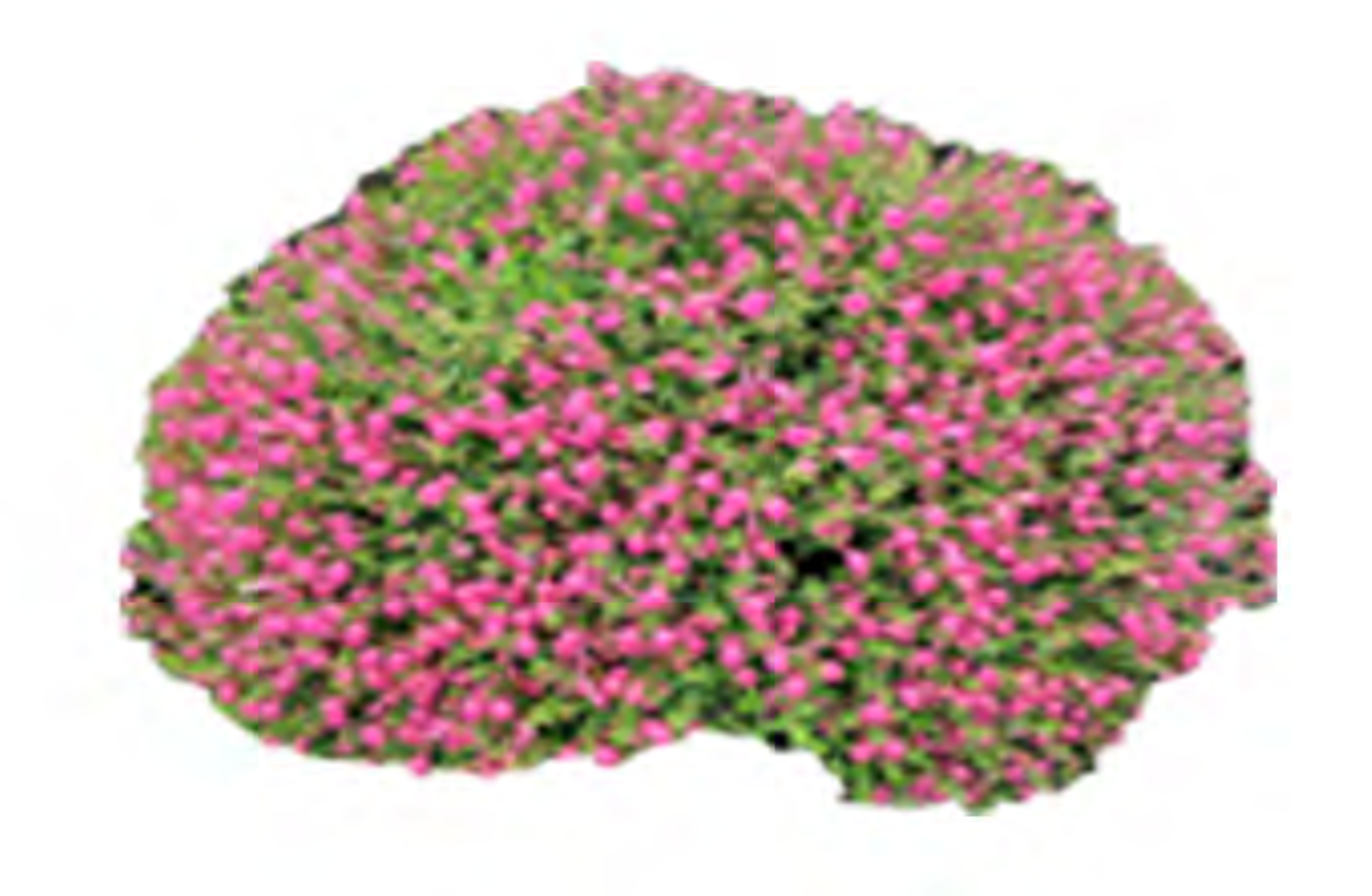
PINK SKULLCAP (SCUTELLARIA SUFFRUTESCENS)