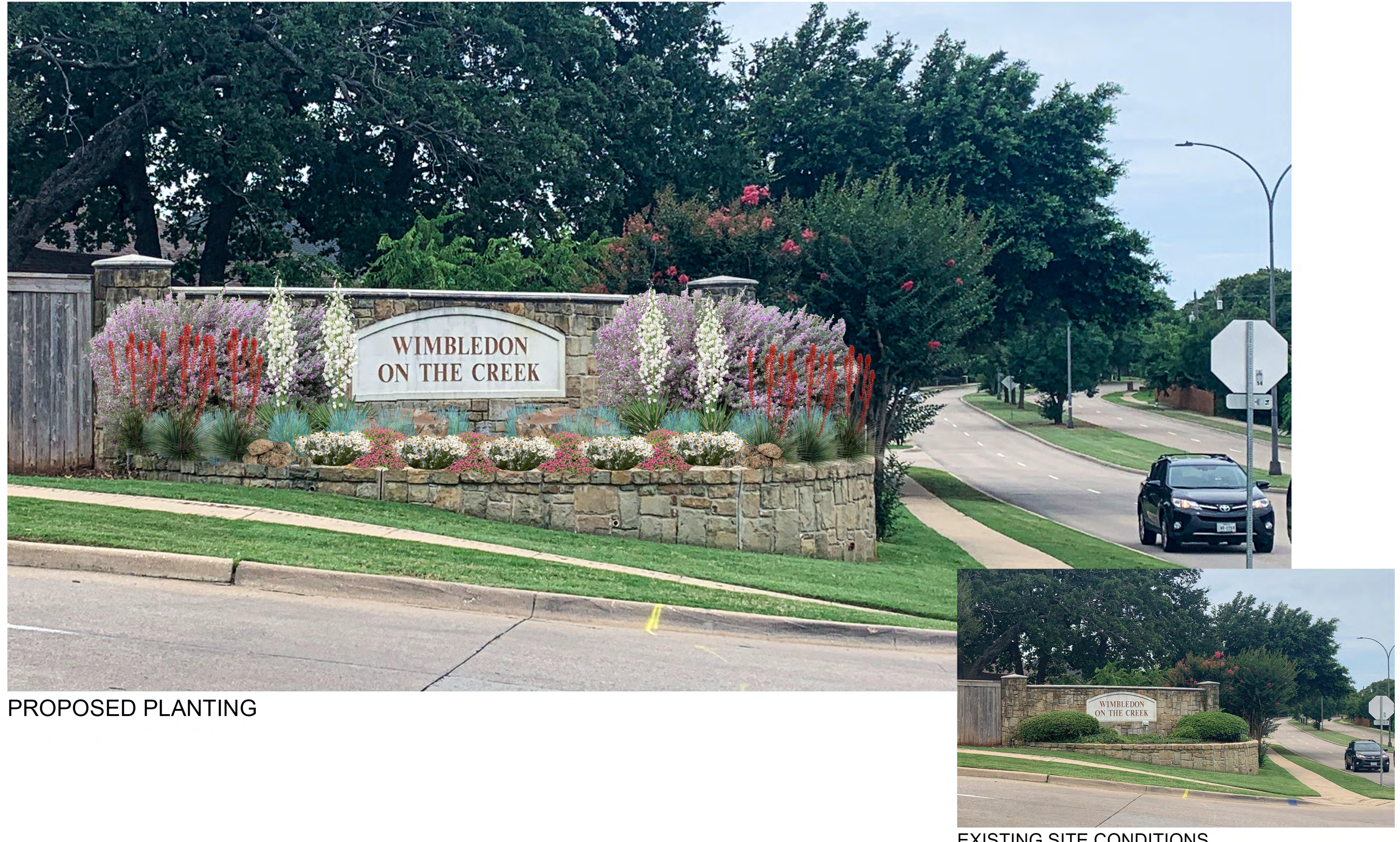
EXISTING SITE CONDITIONS