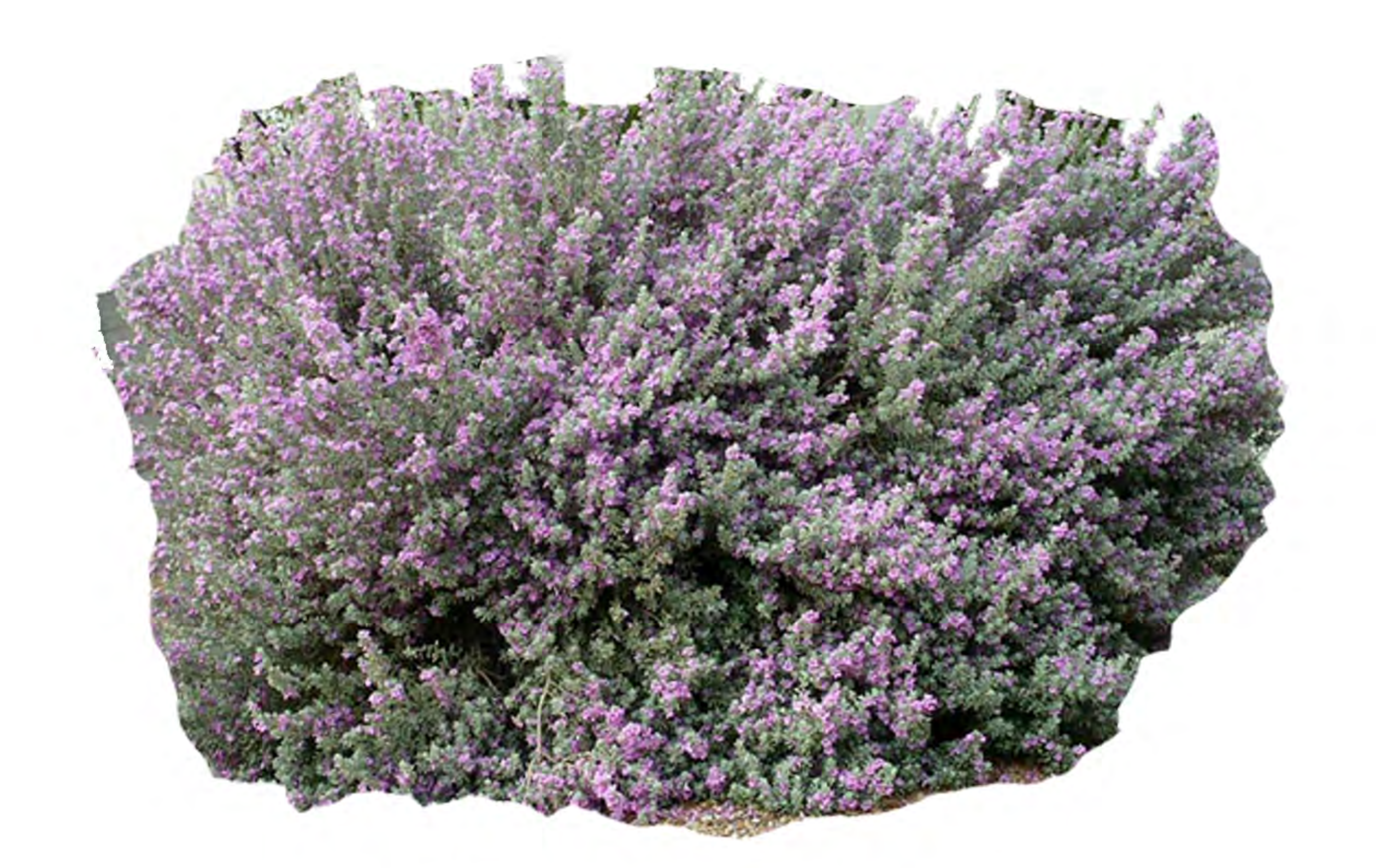
TEXAS SAGE (LEUCOPHYLLUM FRUTESCENS)