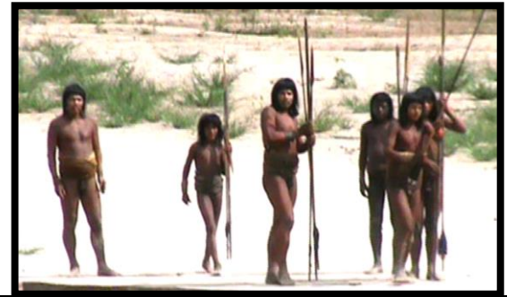
Third contact earlier this year