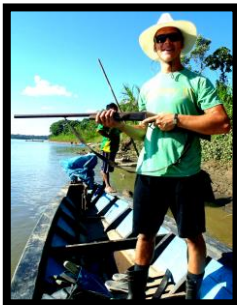
Apt for hunting

amazonmissions@gmail.com www.amazonmissions.com https://www.facebook.com/pages/Amazon-Missions/455768391230318 Twitter: @amazon_missions