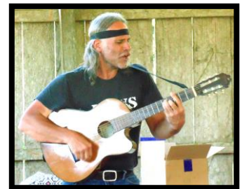
Ministering by music

The Amazon is statistically and scientifically one of the most unreached zones on earth!