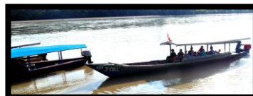
Traveling by canoes

FIGHTING FOR THE LOST AS HE DIED FOR US ON THE CROSS !