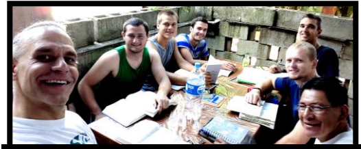
Devotionals – Learning Spanish

It is amazing that JESUS happened to follow the same principle when reaching out to the multitudes of physically feeding the people before he ministered to them spiritually. After this we share about how the Creator sent us to them with a message of hope and good news.