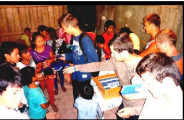
Handing out of Bibles