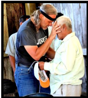
Laying on of hands

At present I am in Gauteng, NW, Limpopo, Mpumalanga, Natal, Free State and surrounding areas sharing about our newly contacted tribe and latest testimonies on them. You are most welcome to invite me to speak to your group , church, home cell, men's or ladies meeting, school, and whatever group you can gather. Please put me to work as much as you like, speeding up the advancement of God's Kingdom. ☺