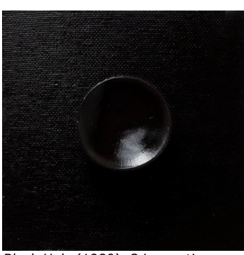
Black Hole (1980). 3 in. suction cup on acrylic painted masonite, 8x8 in.

(July 31, 2012) – Hionas Gallery is proud to announce that for the launch of its 2012 fall season, the gallery has partnered with celebrated Swedish-born abstractionist Siri Berg to stage a redux of the artist's momentous solo show, Black & White 1976-1981 , which originally exhibited at the American Swedish Historical Museum in Philadelphia, March 6 – May 31, 1986.