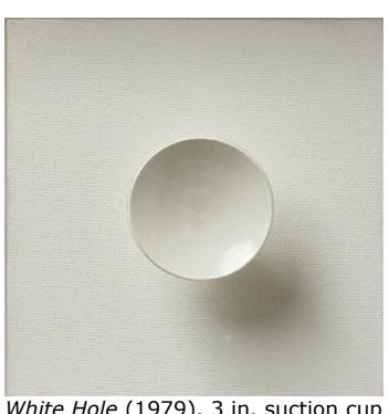
White Hole (1979). 3 in. suction cup on acrylic painted masonite, 8x8 in.