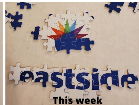
Our progress so far!

Film & Faith will be October 30 at 7pm. Watch for details next week and online!