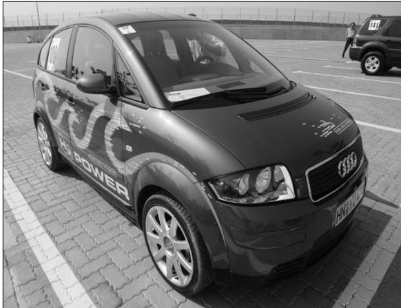
This hydrogen fuel cell Audi A2 was the overall winner.

Results have been posted for the Michelin Challenge Bibendum 2004, which ran from Oct. 12-14 in Shanghai, China. Entrants were scored on acceleration, braking, slalom performance, emissions, fuel efficiency and CO 2 emissions. The top finisher was an Audi A2 converted to fuel cell power, while the next two were an Audi A2 and an A8, respectively, each running on sunfuel diesel (the A8 also came in second in the Rally portion (see below)). The fourth place winner was a solar-powered EV, while the fifth was a Chinese-built battery EV minibus.