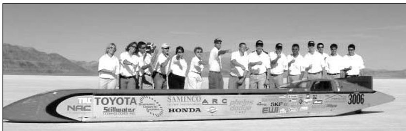
The Ohio State Land Speed Racing Team poses with the Buckeye Bullet, which set the World's Land Speed Record for electric cars with a speed of almost 315 mph.

There is also a possibility that the Buckeye Bullet may now hold the record for the fastest measured speed of any electric vehicle, having reached a speed of 321.8 mph on Oct 14, while the previous record holder, the French TGV-A Bullet Train, ran 513.3 (320.2 mph) on May 18, 1990.