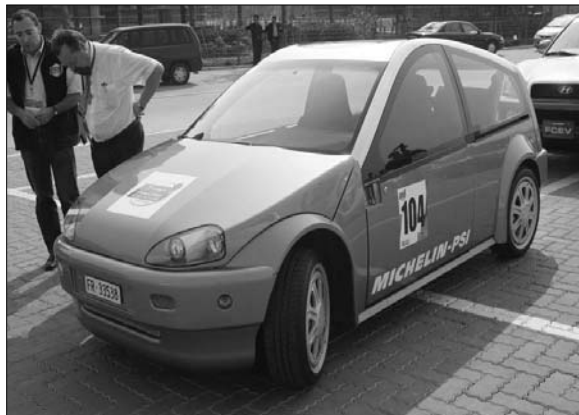
Michelin's fuel cell powered Hy-Lightt

The last of the above cars bears special mention. While not usually thought of as a car maker, Michelin showed its new Hy-Light, which uses a combination of a fuel cells rated for 30 kW and supercapacitors that can provide another 32-45 kW for 14 to 20 seconds during acceleration. Claimed range is 400 km (248 mi) at 80 km/h (50 mph) cruising speed, acceleration from 0 - 100 km/h (62 mph) in 12 seconds and top speed of 130 kph (80