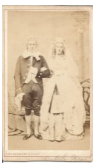
"We, the People"

On March 1, 1781 the Continental Congress gives way to the new Congress of the Confederation, one month after Maryland becomes the final state to ratify the Thirteen Articles, written way back in 1776.