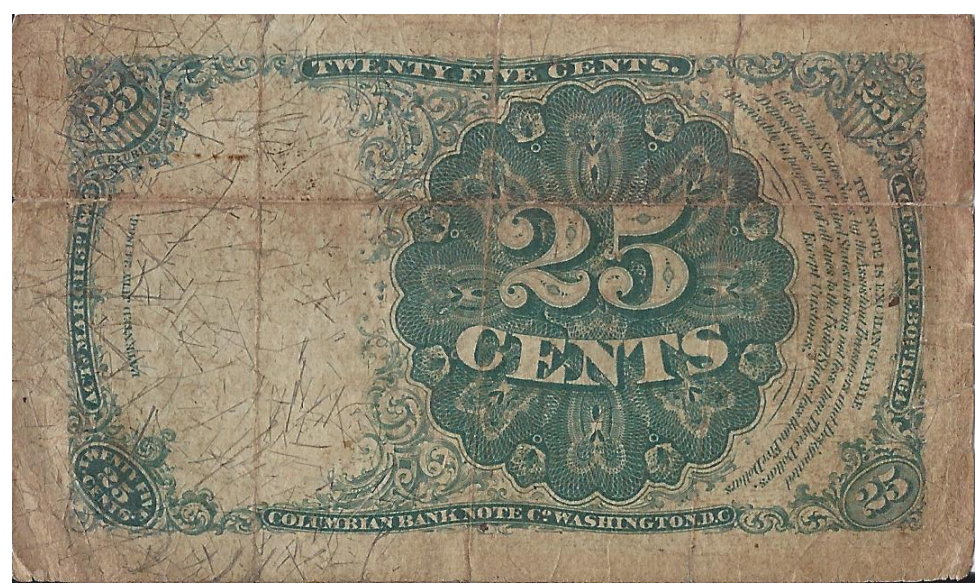
Printed Money, often not "Backed" by Gold/Silver, Suffers from Inflation

Fighting the Revolutionary War has proven immensely costly to both sides.