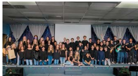
Middle school program.