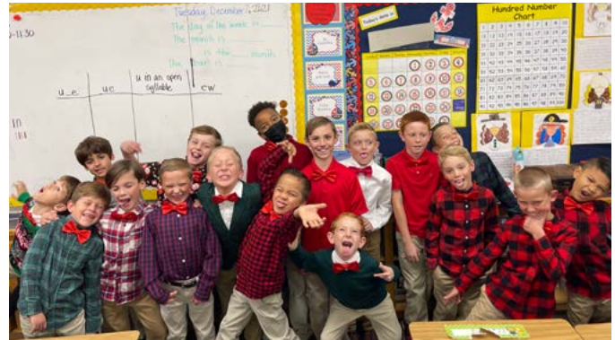
Silly faces before the kindergarten-second grade program.