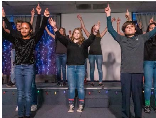
Middle school worship dance group.