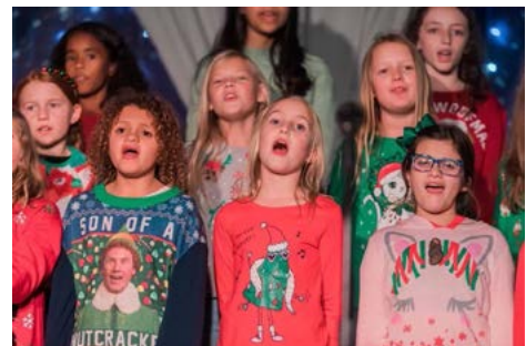
From the third-fifth grade program.