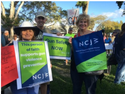
Our Valencia Shores sisters at the rally