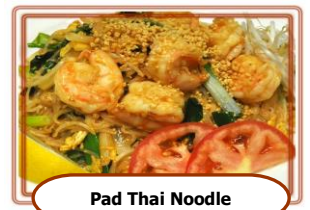
Pad Thai Noodle