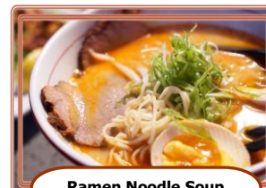
Ramen Noodle Soup