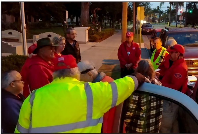
Morning Team briefing at the Coronado Public Library.