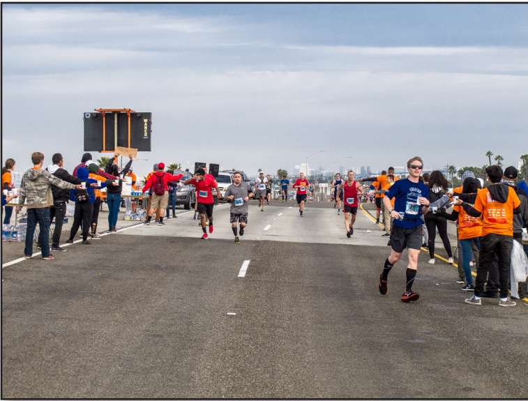
Runners in the Half Marathon and 10 mile races passing water stop 3.