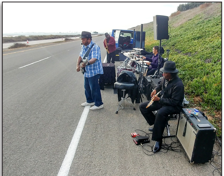
Each water stop had a band playing for the entertainment of the runners. This group was at Water Stop 4.