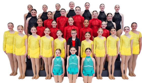
Elite Company 2022-2023

Thank you for considering us! The Staff of Studio 55 Dance