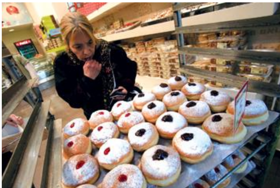
A woman on King George Street in Jerusalem appears perplexed picking from the array of sufganiyot choices for Chanukah . See Marcy Oster's description of Chanukah in Israel on page 5.

I can't find the reference, but I recall reading that the Jews in Holland used Hanukkah to celebrate the driving out of the Spanish occupation from Holland. This must have added some additions to the Hanukkah menu.