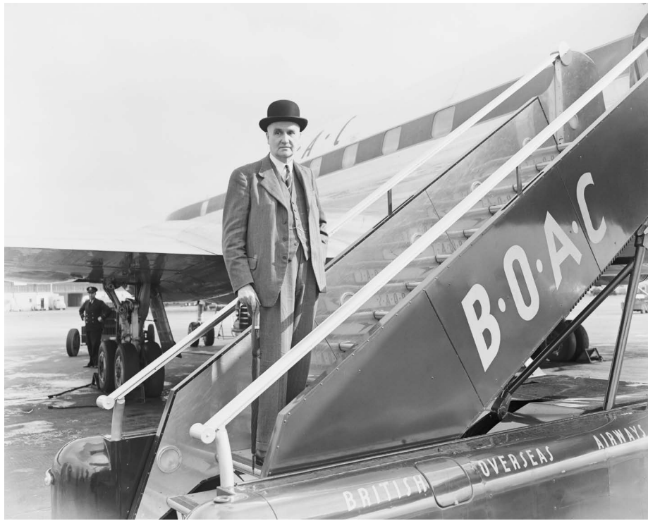
Frederick Lindemann boarding a flight from London to Australia in 1953.

lecture, now regarded as one of his most influential, entitled 'On the Method of Theoretical Physics'. He began by expressing his "great gratitude" to the university, and his feeling that "the links between this university and myself are becoming progressively stronger". But this was not to be realized. Soon, Einstein left Oxford for Glasgow, then Belgium. He revisited the United Kingdom briefly in July, to meet Churchill together with Lindemann, and returned from Belgium to spend part of September and October at a secret address in Norfolk, to escape likely assassination by Nazi agents – but he did not go back to Oxford. He would never see the city again after he moved to Princeton in New Jersey, to the great disappointment of Lindemann, who had hoped Einstein would settle in Oxford.