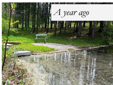
A year ago