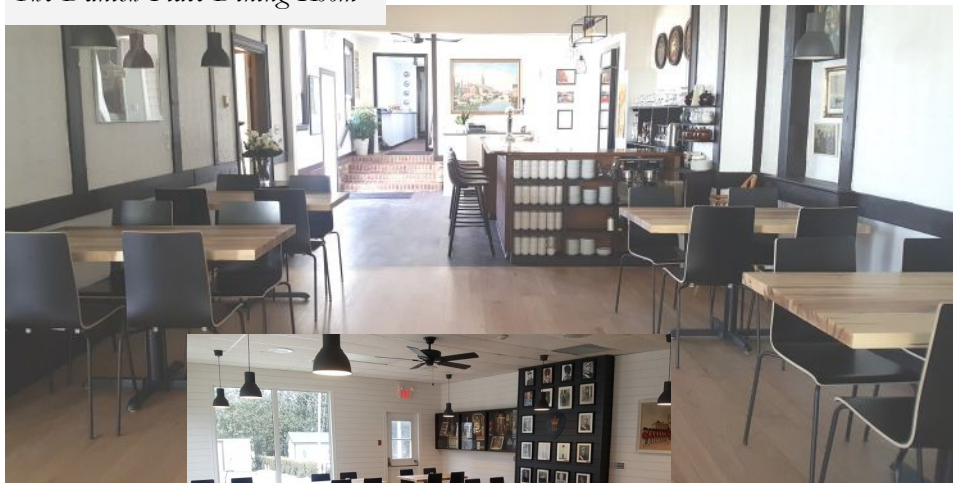
The Danish Place Dining Room