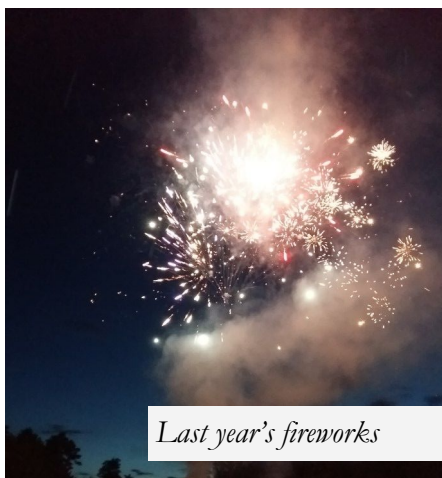
Last year's fireworks