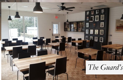
The Guard's Room