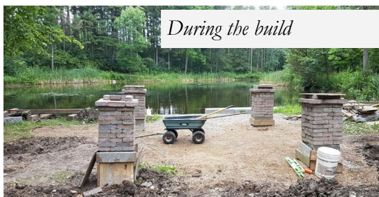
During the build