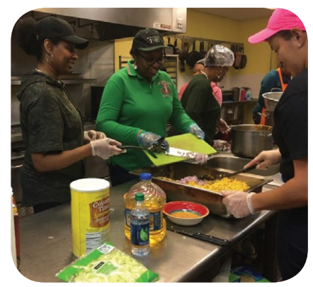
Psi Psi Omega Chapter members making lunch for the residents of the Brisben Center.