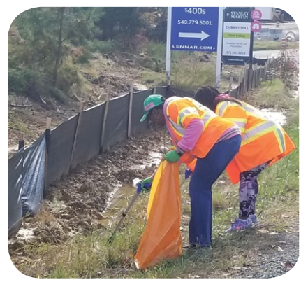
Psi Psi Omega Chapter members volunteering during our fall highway clean up initiative.