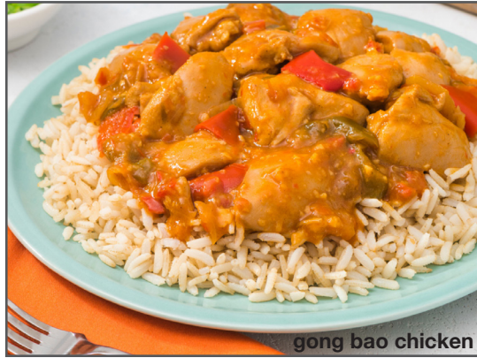
gong bao chicken