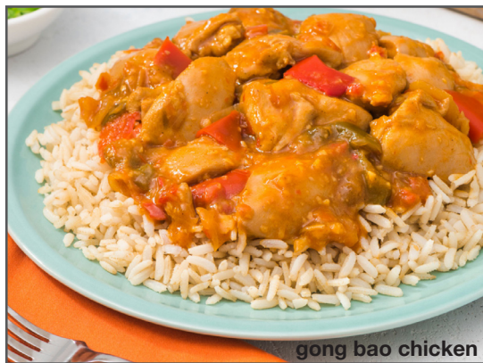
gong bao chicken