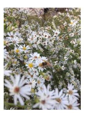
Heath Asters with Bees

To conclude, using cilantro and lavender twigs as smoker fuel do not protect against Varroa, but their smoke is pleasant and calms me and seems to calm my bees as well!