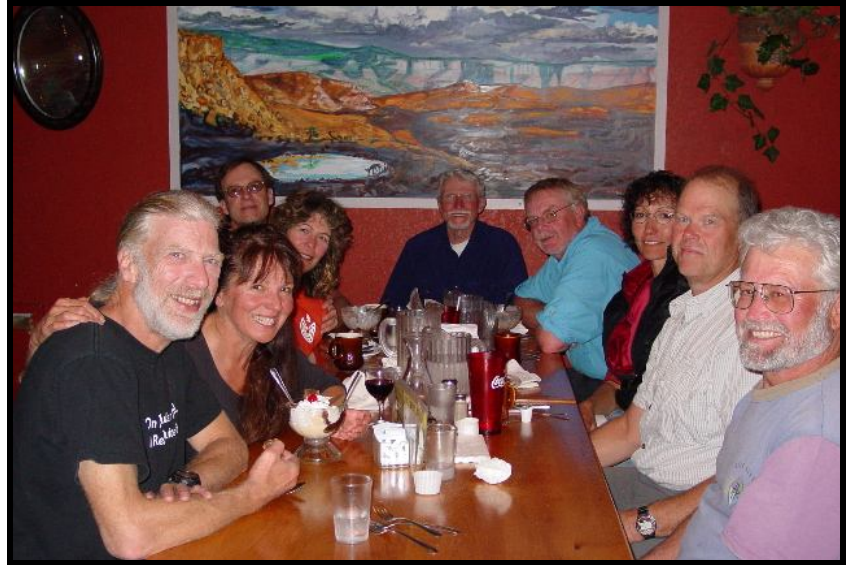
Our Celebration Dinner, after a shower