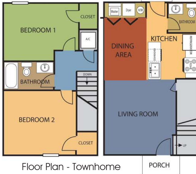
Floor Plan - Townhome