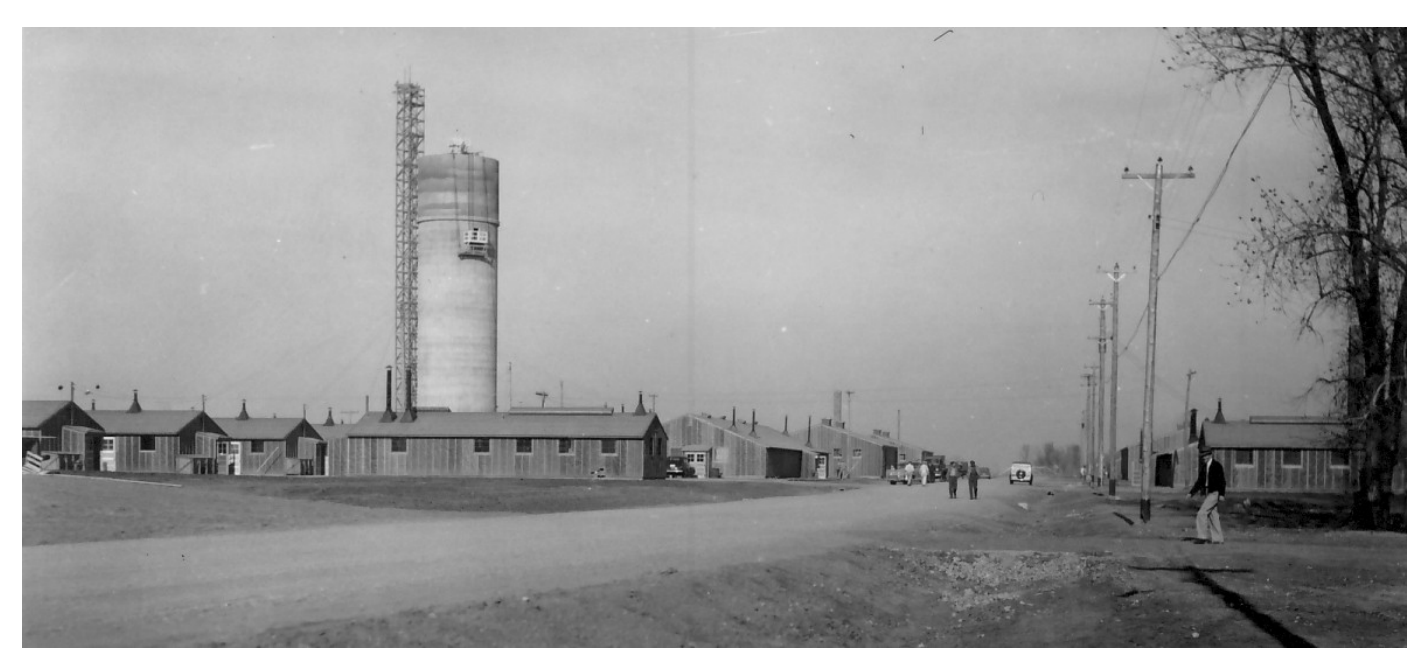
The above photo was taken in 1942 of the entrance to the Air Base located north of Mitchell. The Air Base closed after WWII and was given to the City of Mitchell. It is now Mitchell's airport.

FamilySearch has recently added more than 43.6 million indexed records and images from BillionGraves, Italy, and the United States. Notable collection updates include the 10 new indexed war records collections, including: the <u>United States</u>, <u>World War II Prisoners of War of the Japanese</u>, 1941-1945, <u>collection</u>, the <u>United States</u>, <u>Korean War Battle Deaths</u>, 1950-1957, <u>collection</u>, and the <u>United States</u>, <u>Casualties of the Vietnam War</u>, 1956-1998, <u>collection</u>. Search these diverse collections and more than 3.5 billion other records for free at <u>FamilySearch.org</u>.