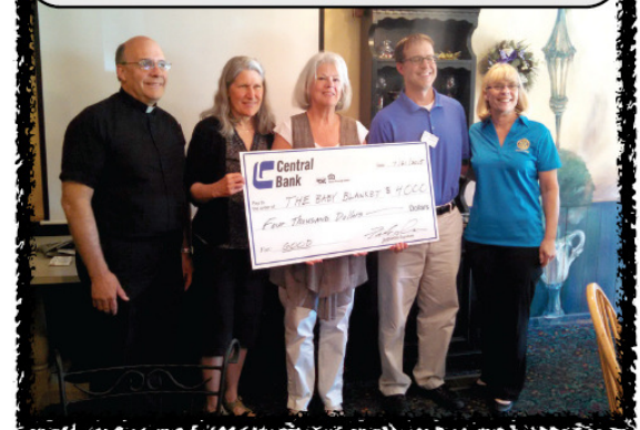
Annual Golf Tournament Fundraiser