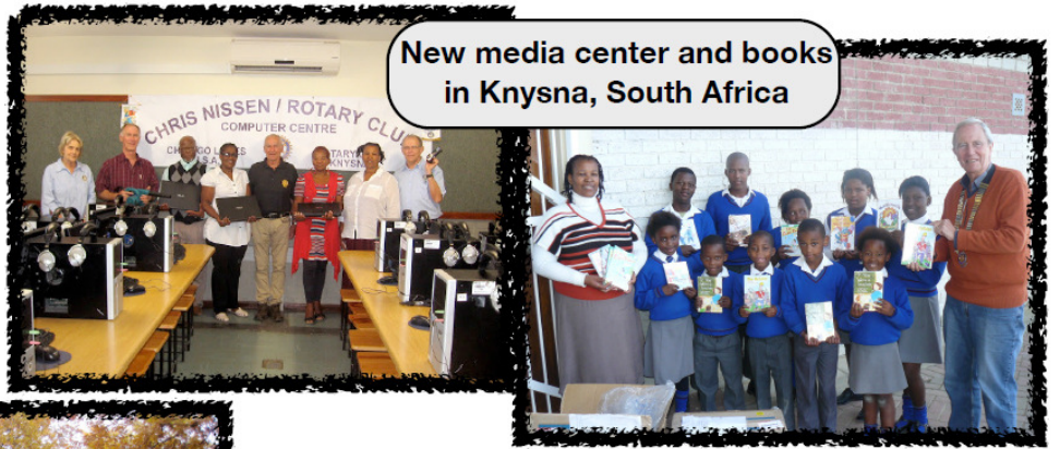
New media center and books in Knysna, South Africa