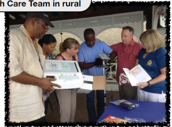
Medical Equipment and Health Care Team in rural