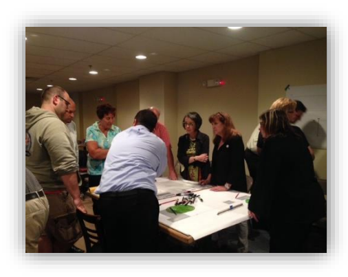
Participants provide ideas and recommendations for the core of the downtown during a design workshop held on August 12<sup>th</sup>.