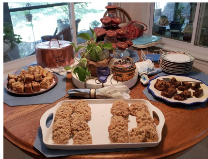
Sweet and Savory: Chocolate-Pear Muffins, Pumpkin-Spice Loaf, Toasted Oatmeal Cookies, Maple-Pecan Blondies, Nachos with Refried Beans and Chorizo, plus Spicy Pecan Cheese Dip and Brisket and Black Bean Chili combined for a sumptuous meal.