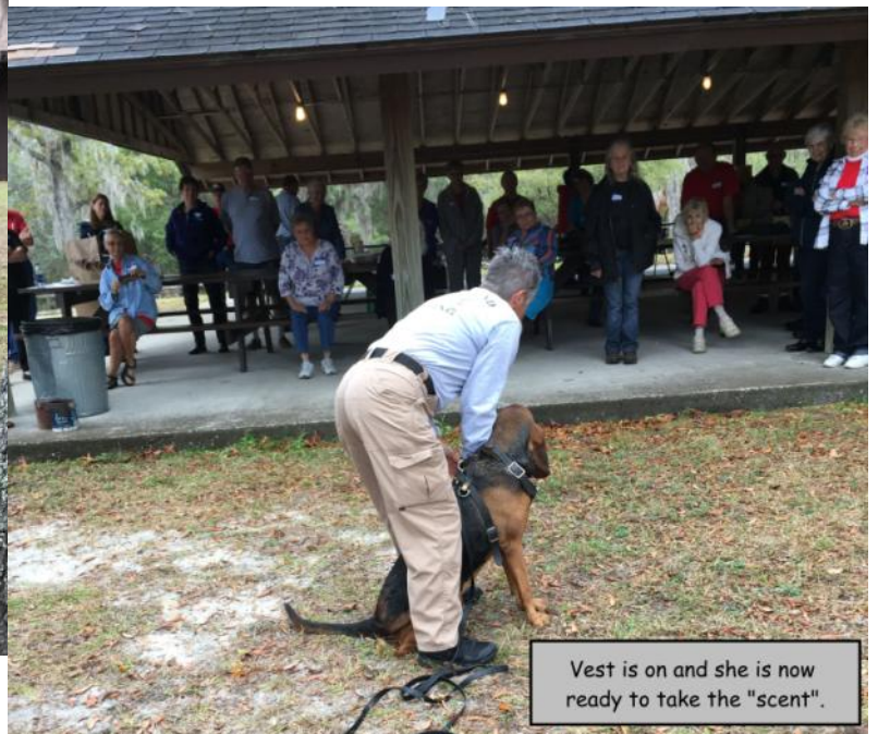
Vest is on and she is now ready to take the "scent".