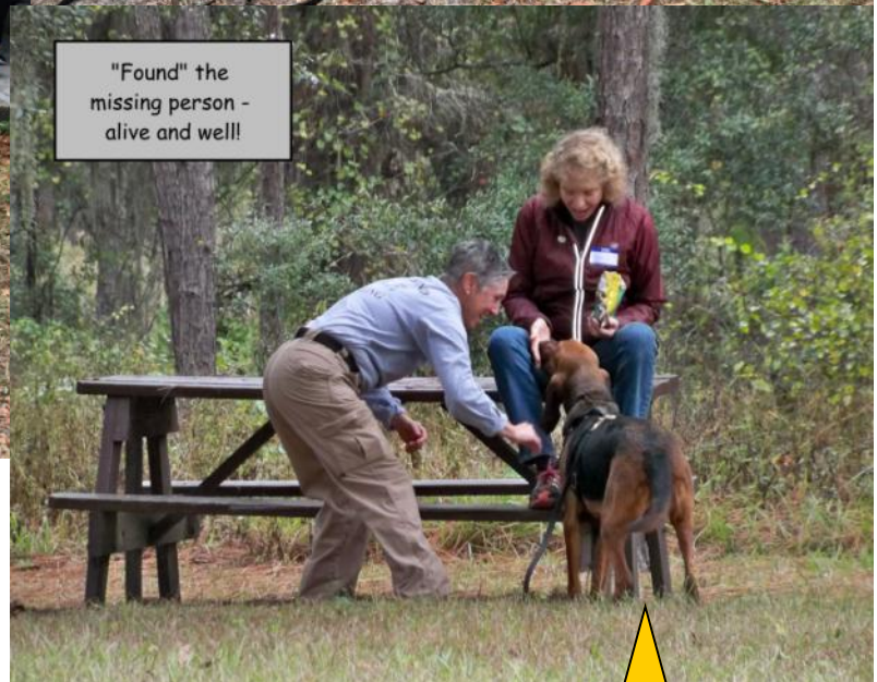
"Found" the missing person - alive and well!