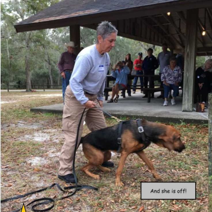
And she is off!