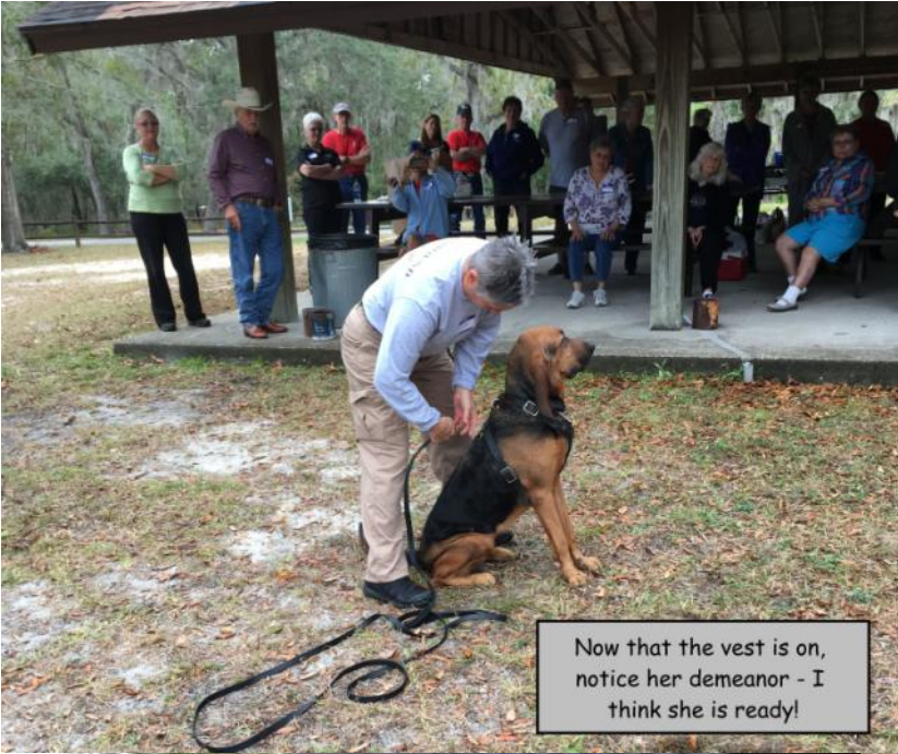
Now that the vest is on, notice her demeanor - I think she is ready!