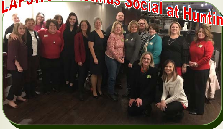
LAPSWV Christmas Social at Huntington Ale House