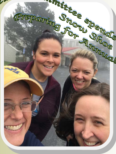
Executive Committee spends the weekend at Snow Shoe preparing for Annual Meeting