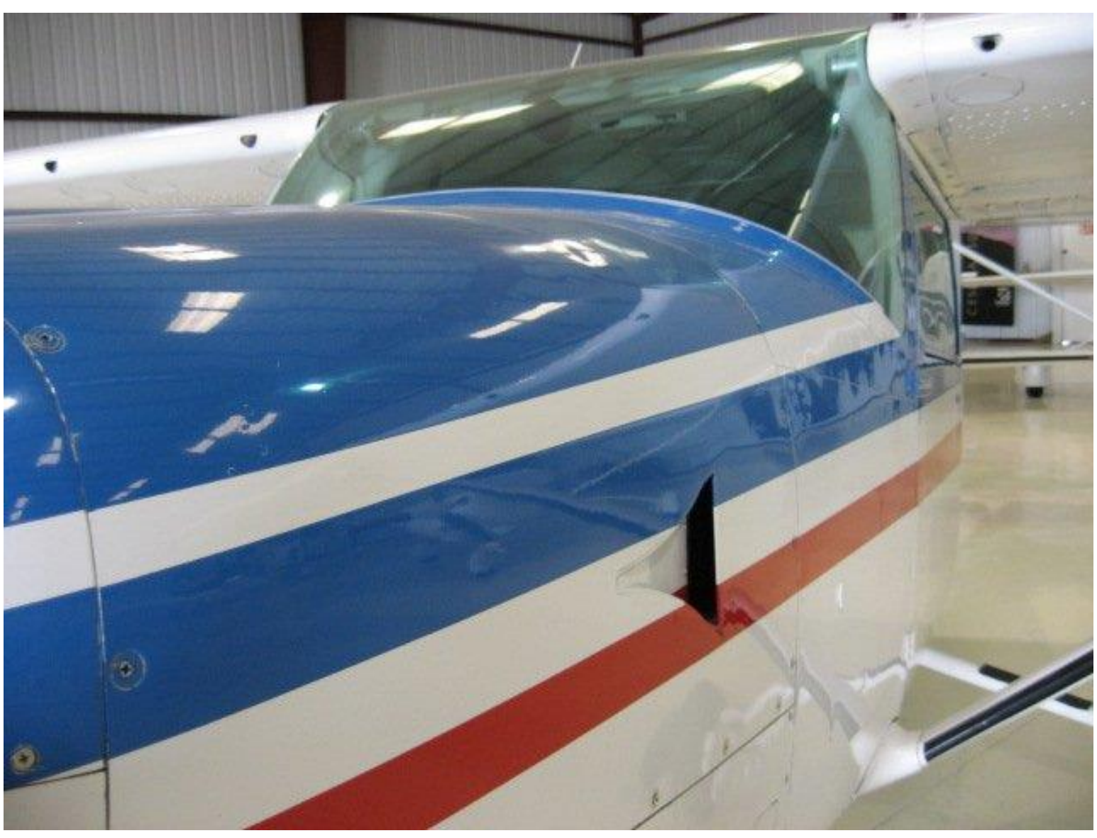
Aircraft specifications and logbooks are subject to customer verification and do not constitute representations or warranties of International Aircraft Sales, Inc. (referred to as IA Jet).