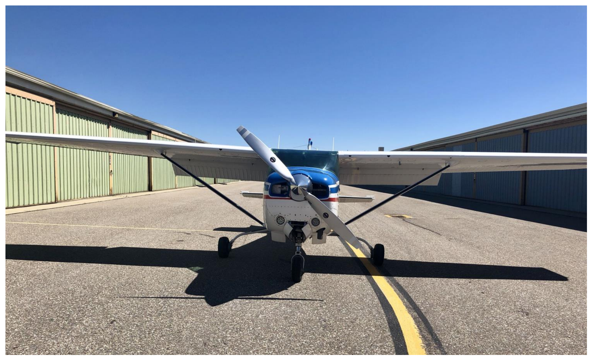
Aircraft specifications and logbooks are subject to customer verification and do not constitute representations or warranties of International Aircraft Sales, Inc. (referred to as IA Jet).

Specifications Overview Photo Gallery 10