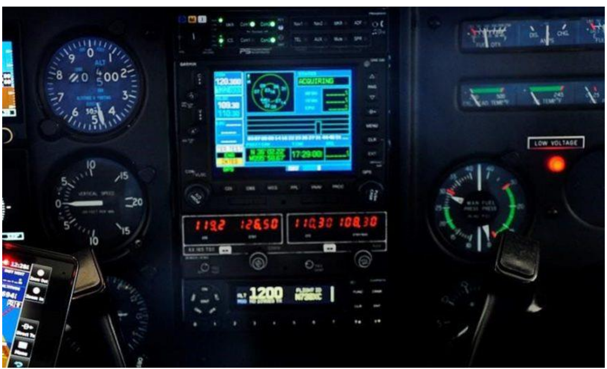
Aircraft specifications and logbooks are subject to customer verification and do not constitute representations or warranties of International Aircraft Sales, Inc. (referred to as IA Jet).