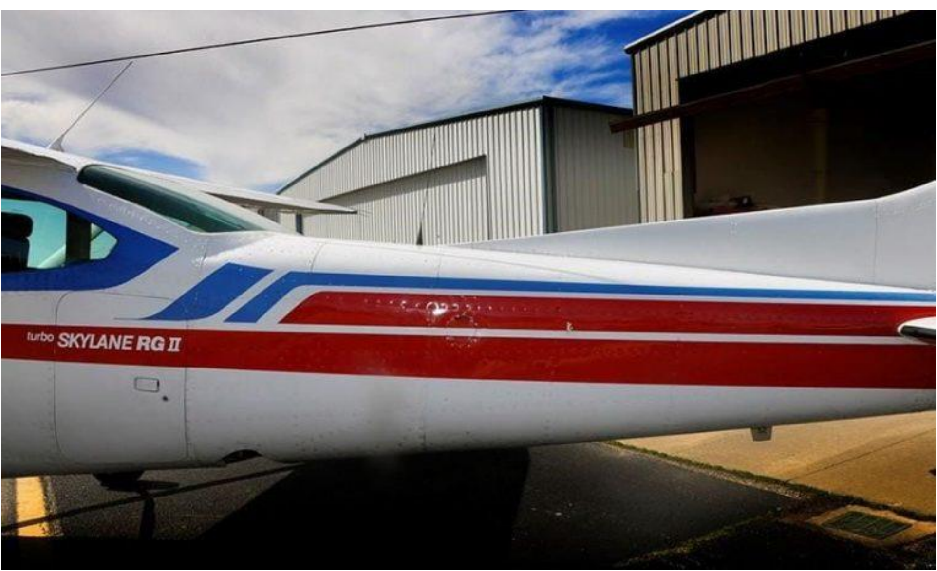
Aircraft specifications and logbooks are subject to customer verification and do not constitute representations or warranties of International Aircraft Sales, Inc. (referred to as IA Jet).