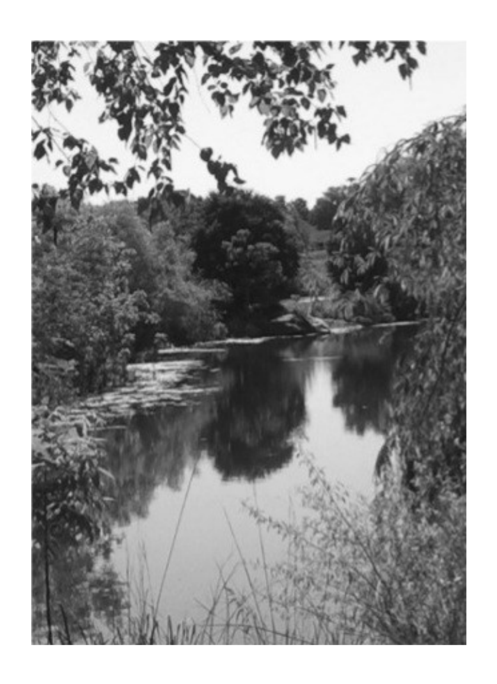
Pathworkings of Natural Magick