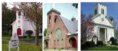
LUTHERAN PARISH OF NORTHERN DUTCHESS