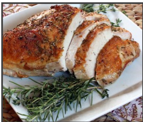
TURKEY BREAST WITH PAN GRAVY