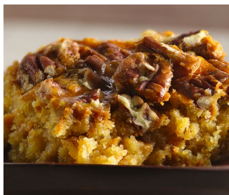
PUMPKIN "COBBLER" CAKE