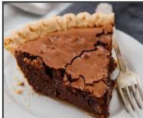
CHOCOLATE FUDGE PIE