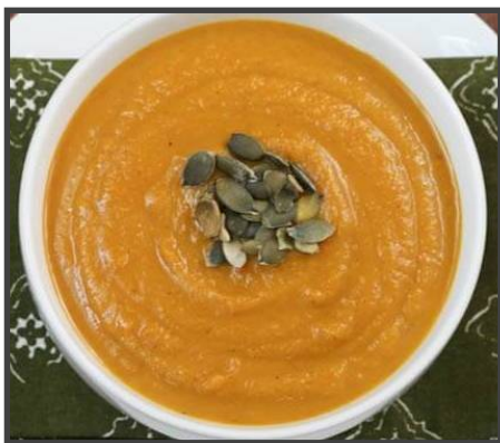
PUMPKIN CORN CHOWDER