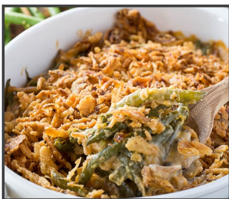
NOT YOUR MOM'S GREEN BEAN CASSEROLE