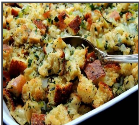
CORNBREAD CHALLAH DRESSING