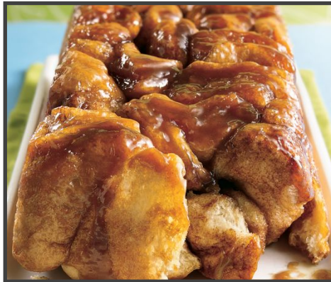
SWEET MONKEY BREAD