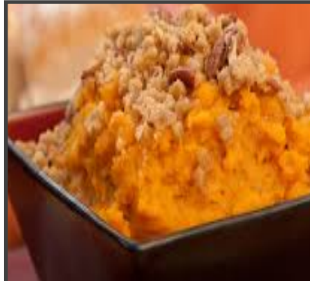
SWEET POTATO CASSEROLE