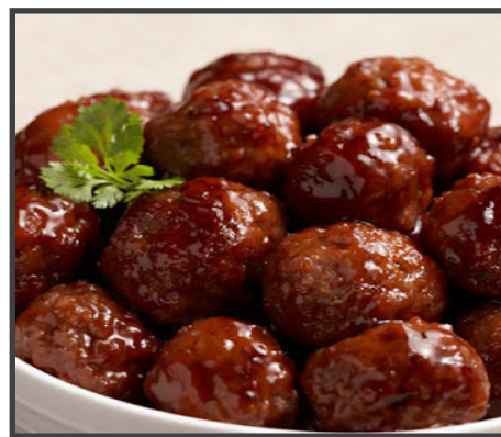
CRANBERRY COCKTAIL MEATBALLS