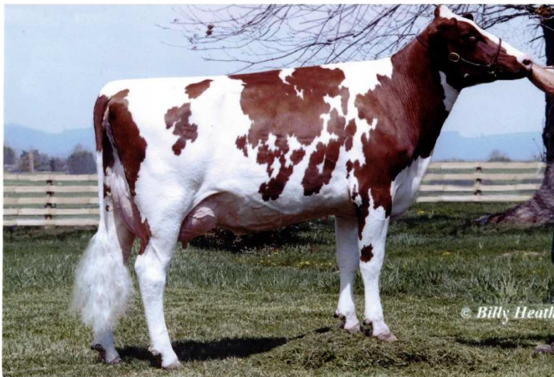
Kenwan Rubens Pretty Red VG-86