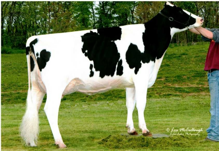
Janney Stormatic Asia VG-87