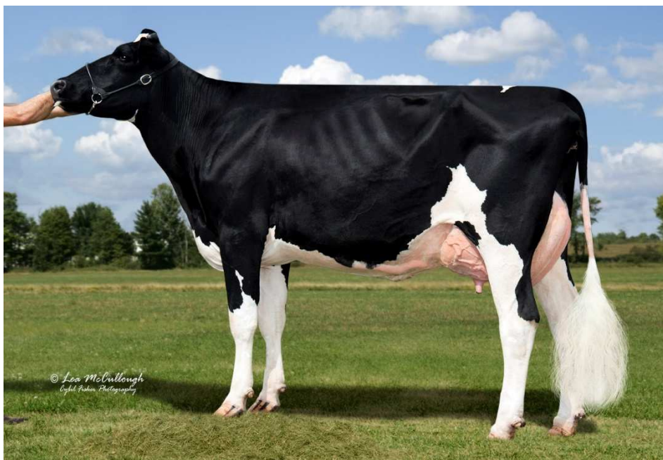
JANNEY TALENT SKYLA VG-88