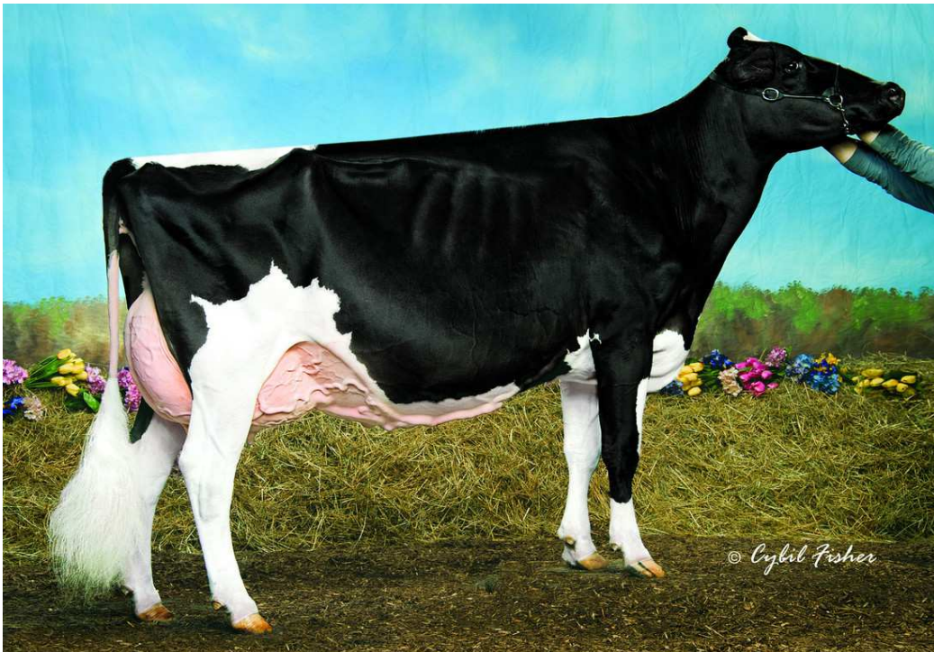
RAINYRIDGE TALENT BARBARA EX-95