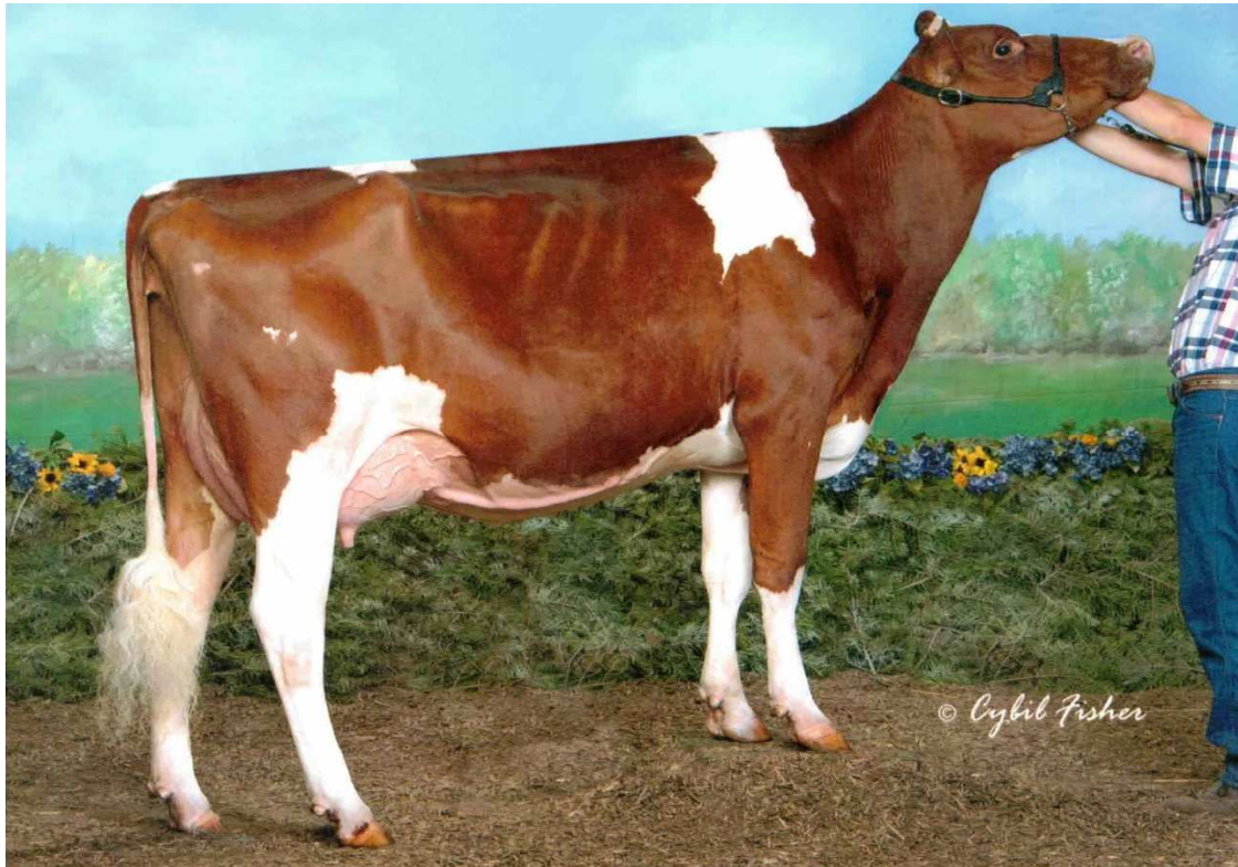
JANNEY ADVENT SYDNEY-RED EX-91