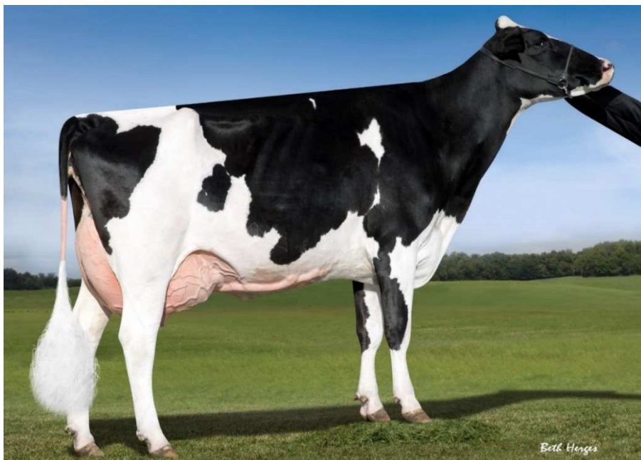
MDF GOLDWYN BREEZIER 39-ET Pictured to right.