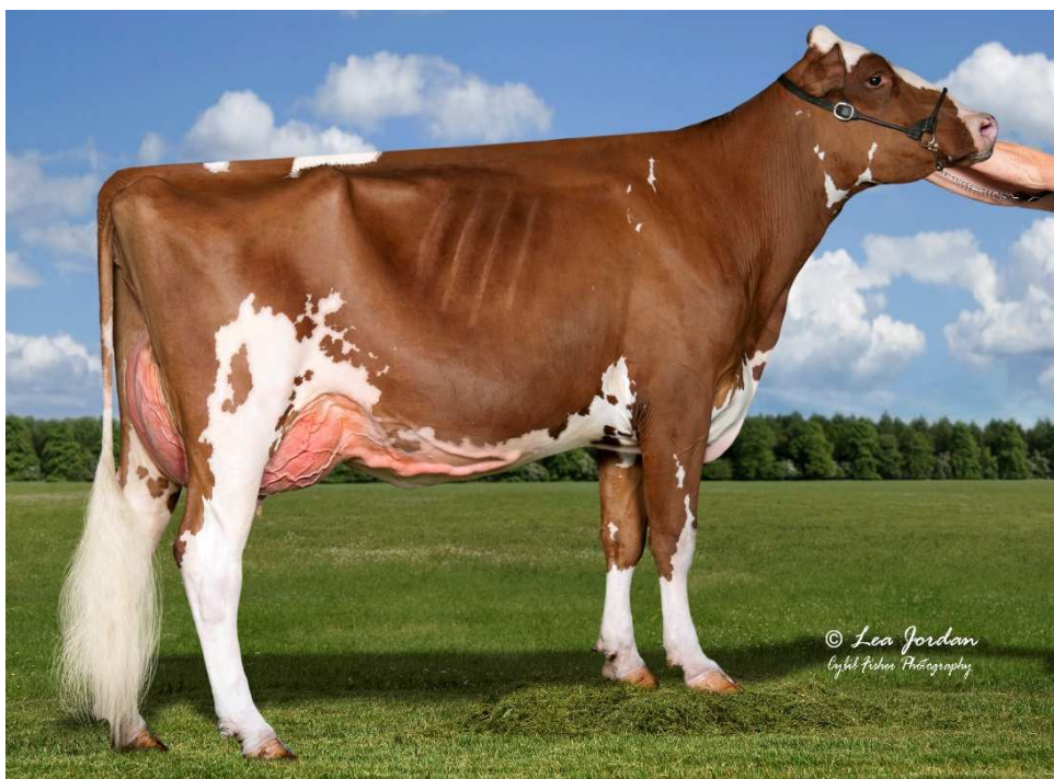
MILKSOURCE DFNT LACY-RED-ET VG-88