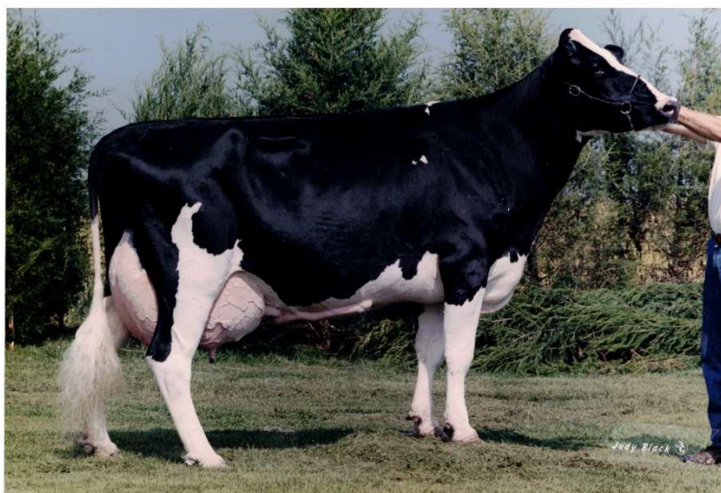
Kenwan BJ Pretty Flavia EX-91

USA 138056452 100%RHA-NA 3-07 86 VVVVV 4-01 2X 329 21700 4.4 1012 3.6 771 5-03 2X 320 25340 4.4 1116 3.4 859