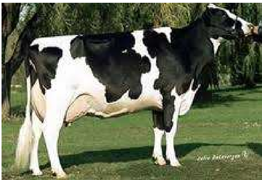
HANOVERHILL TONY RAE EX-96

USA 139465411 100%RHA-NA 6-04 91 EEEVE 2E 06/19/2008 6-06 2X 305 26220 3.3 863 3.1 813 8-04 2X 305 24110 3.2 774 3.0 730 LIFE 2253 158540 3.3 5182 3.1 4955