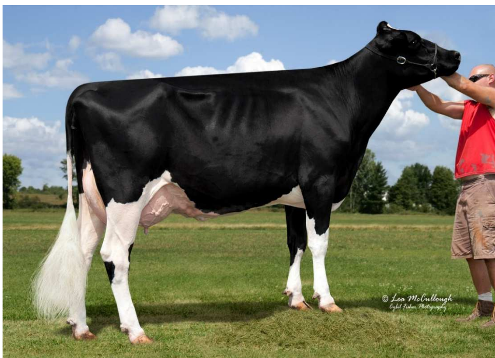
JANNEY TALENT EXQUISITE EX-91 2E Sells as Lot 721