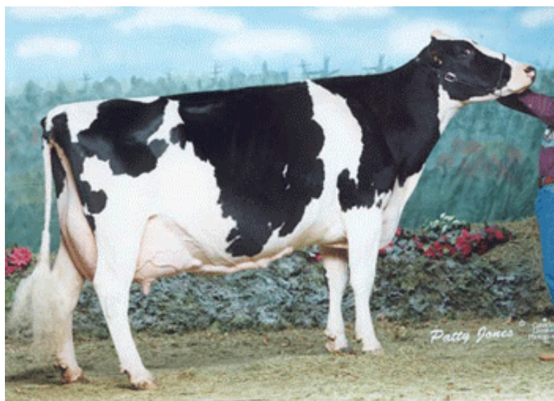
Stookey Elm Park Blackrose -ET EX-96