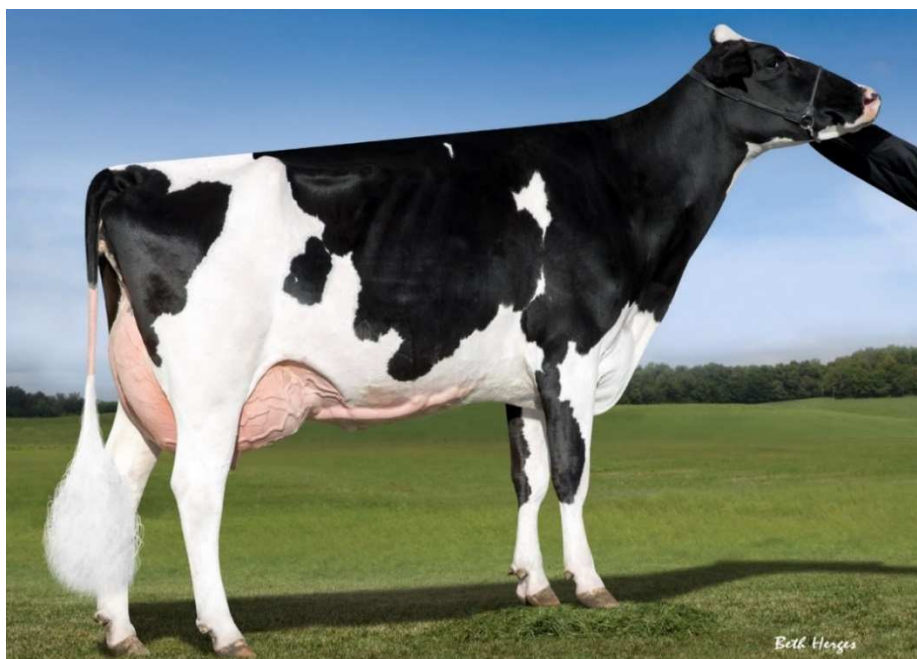
MDF GOLDWYN BREEZIER 39-ET Pictured to right.