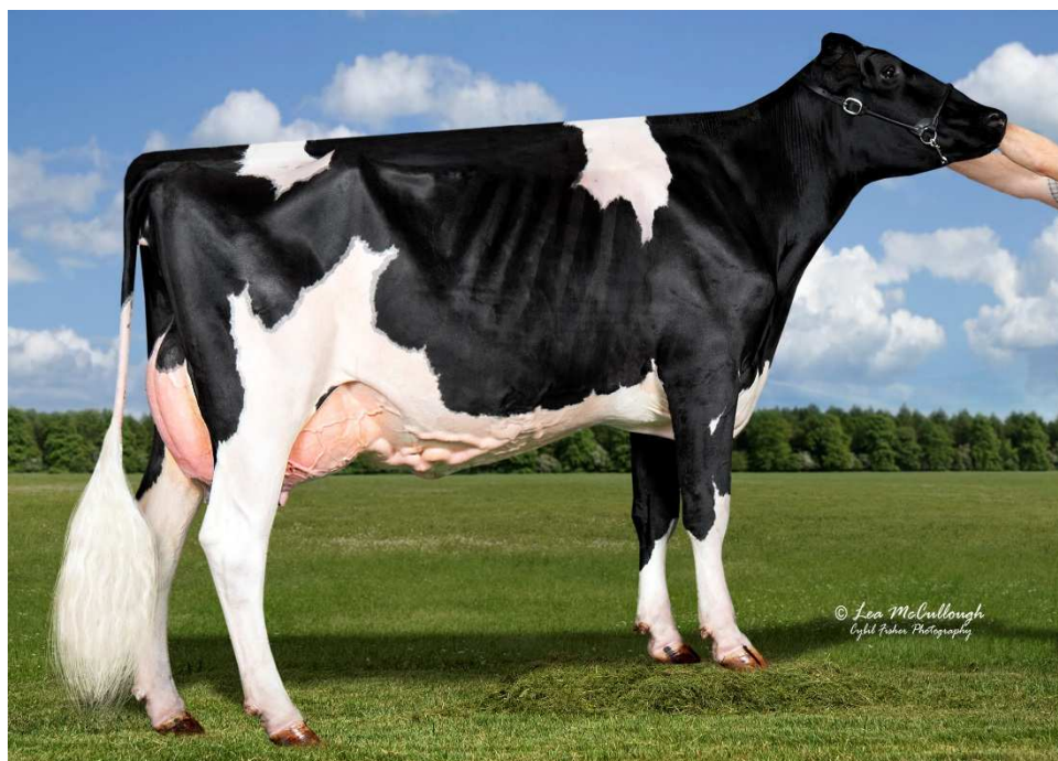
Harvue Windhammer Foxy-ET EX-91