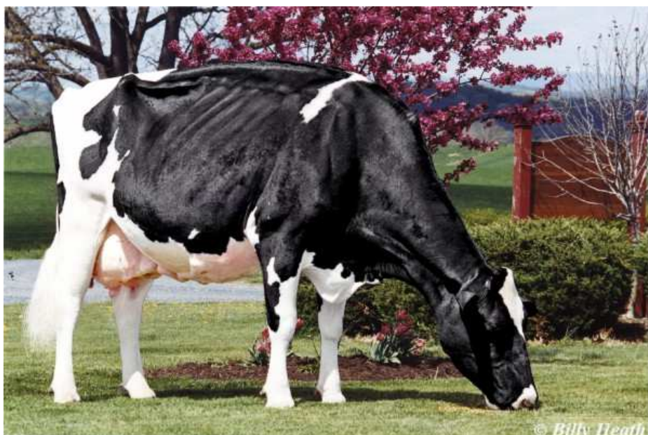
Gloryland Lana Rae EX-94

USA 137341490 100%RHA-NA 5-08 87 VVE+V 5-07 2X 360 26080 4.0 1035 3.2 822 7-00 2X 119 10510 3.4 362 3.0 311