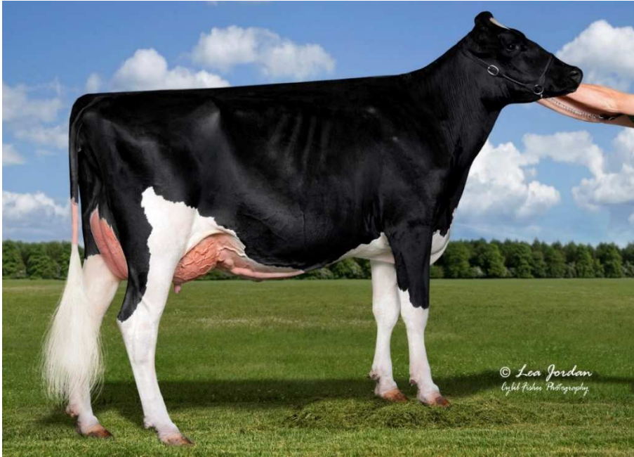
JANNEY GLDN DREAMS EXCEL-ET VG-87