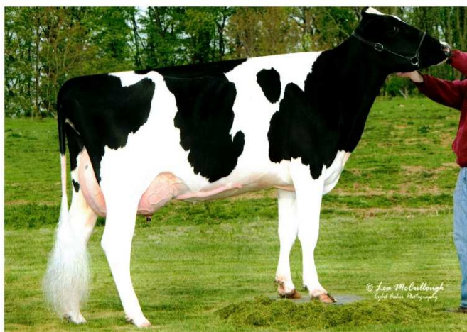
COWTOWN TOYSTORY TRINKET EX-90

USA 140047592 100%RHA-NA RC Born: 05/02/2009 6-00 85 V+VV+ 2-00 2X 318 17880 3.6 642 3.3 583 3-01 2X 278 21040 3.2 679 3.2 677 4-00 2X 281 24100 3.3 800 3.3 785 5-00 2X 305 25510 3.6 919 3.1 779 6-03 2X 293 23580 3.5 835 3.1 732 LIFE 1856 138270 3.5 4834 3.2 4423