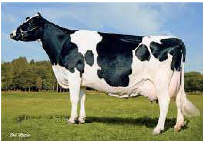
9th Dam: C Glenridge Citation Roxy EX-97

USA 137341490 100%RHA-NA 5-08 87 VVE+V 03/01/2006 3-04 2X 305 19350 3.8 729 3.0 574 4-08 2X 224 11990 3.9 467 3.2 381 5-07 2X 360 26080 4.0 1035 3.2 822 7-00 2X 119 10510 3.4 362 3.0 311