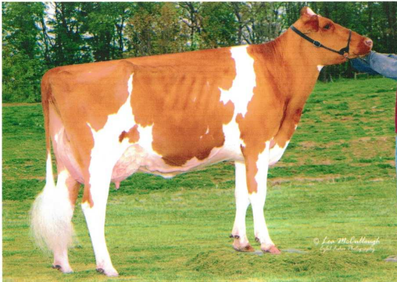
Grand Dam: Janney Talent Sedona-RED EX-91