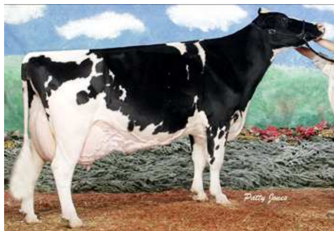
SHOREMAR S ALICIA-ET EX-97 3E

USA 140679674 100%RHA-NA 5-01 91 EVEVE 03/06/2010 3-06 2X 305 22630 4.1 925 3.1 710 4-08 2X 181 16780 3.6 609 2.9 486