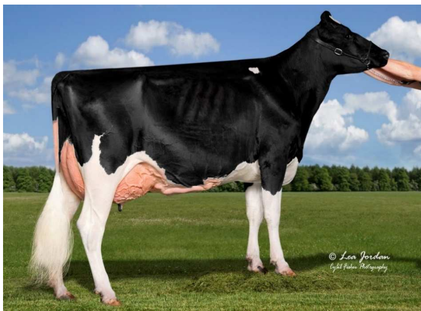
Pictured to Right: JANNEY ABSOLUTE ARIA EX-90 Selling as Lot 4

3rd Dam: Bendy-Brook Odyssey Favorite EX-92 2E EVEEE DOM