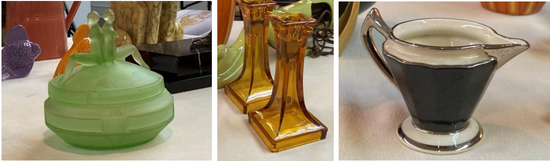
Lisa Stejr's green frosted jar/powder box with 2 nudes on top. Allison Clarks's amber candle sticks from the late 20's. Charlotte Upadyay's mid 20's creamer from teapot set made for hotels and trains.