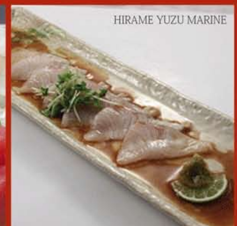
HIRAME YUZU MARINE