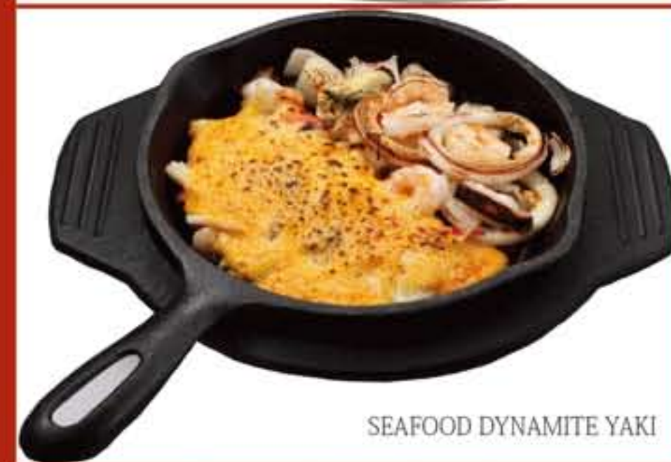
SEAFOOD DYNAMITE YAKI

SPECIAL SASHIMI MORI from 20 Please Ask Staff 本日の特選刺身盛