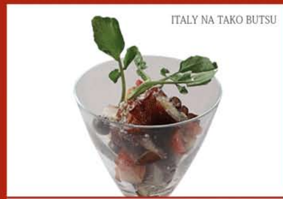
ITALY NA TAKO BUTSU

CRAB CREAM CROQUETTE 6.75 カニクリームコロquette