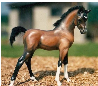
CHAMPION FOAL: IKAZUCHI (AC)

Longear/Exotic/Fantasy Foal (10): 1-Get Your Groove On (JC), 2-Jumanji (CV), 3-Out of Africa (JC), 4-Zenda (JP), 5-SMF Waltzing Matilda (CV), 6-SP Baby Blues (IC), 7-Beakman (SSu), 8-Chloe (CS), 9-Grits (BH), 10-Jewels (HC)