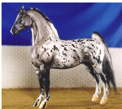
RESERVE CHAMPION GAITED BREED: MISTY THREE-KAY (AC)

Clydesdale/Shire (18): 1-RM Nuclear Winter (KW), 2-Amazing Heart (SN), 3-Sparrowwood Rob Roy (SSu), 4-RAS Elian Demoiselle (CM), 5-Deloyer Donald (AC), 6-TS Bonnie Red (MP), 7-PR Burning Blue Soul (JV), 8-TS Annie Red (MP), 9-Rumneyhill Victoria (SN), 10-SR Mighty Mo (SSt), HM-Deloyer Starblazer (AC)