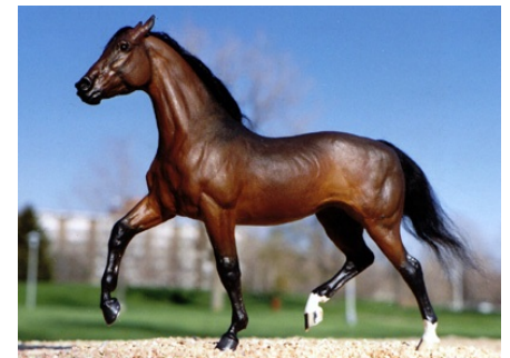
RESERVE CHAMPION SPORT BREED: QUICK COMET (AC)