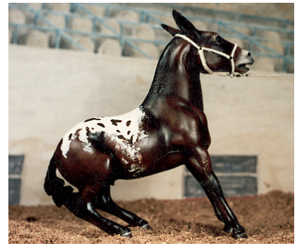
Wichita Rock (CM), 7-Bright Lord (SSu), 8-Excel (JP), 9-Do Wacka Do (SSu), 10-Betelgeuse (SSu)