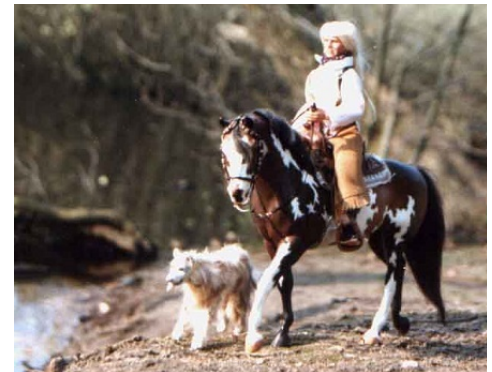
Scenes: Digital & 35mm Photo (8): 1-Alamitos Ridge: Ride with Jace (RN), 2-Whippoorwill Incognito (BR), 3-Bluegrass Frecles: Cow Work, 4-Regina Kashmir (BR), 5-LBR The Pinkeyed Stallion: Winter Prairie (RN), 6-LBR Kybele: Visiting Marbach (RN), 7-LBR The Pinkeyed Stallion: Frozen Prairie (RN), 8-Carousel (HC)