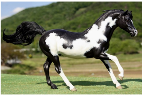
Mountain Mist