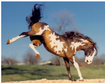
CHAMPION EXTREME REMAKE/RE-PAINT/HAIR OR SCULPTED M/T: BLOODBATH HIGHWAY (CV)

(5): 1-Whippoorwill Drop Dead Fred (BR), 2-Anise (BR), 3-Queen's Gambit (JC), 4-LL Tidal Wave (SM), 5-DQ April Whisper (SSt)