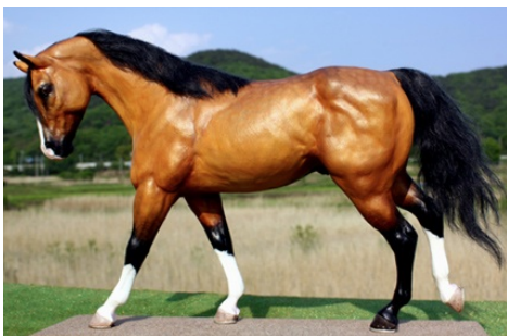
RESERVE CHAMPION STOCK BREED: POWDER RIVER (AC)