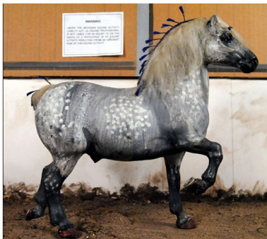
CHAMPION DRAFT BREED: KING DEVEROUX (SSu)

Other Pure/Mixed Draft Breed (1): 1-Tug Hill By Request (CM)