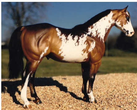
RESERVE CHAMPION STOCK BREED: MARS FLASH (AC)

Arabian (84): 1-Gossamer Wings (KW), 2-KAS Dream Dancer (BH), 3-Hathor (SN), 4-Tech Noir II (AI), 5-Silver Mist (SSt), 6-TEA Sheeba (SN), 7-RM Pravda (CV), 8-Warlord (VF), 9-PR Nazeem (JV), 10-RAS Zen Amako (AC), HM-D.O. Baccrat (JW)