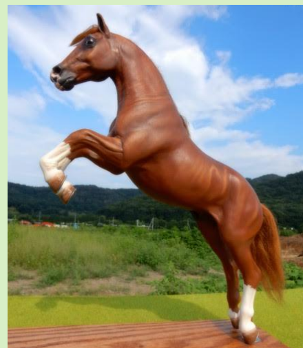
Merkury Zephir 25 Years Old!