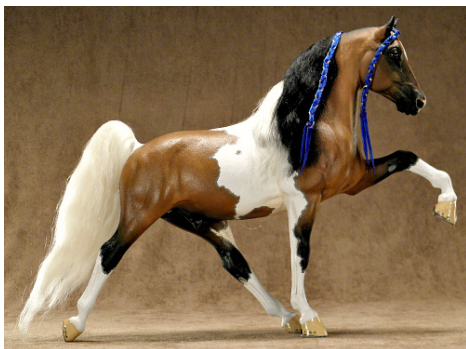
CHAMPION GAITED BREED: RM TWO-TONE STARBURST (CM)

Chablis Z (CM), 6-Midnight's Mac (CV), 7-TS Galilean Dragoness (MP), 8-Thumbs Up (HC), 9-Ima Travelin' Man (CM), 10-Hit the Switch (SSu), HM-TS Autumn Nor'easter (MP)