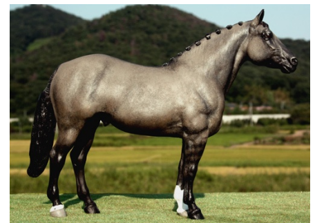
RES. CHAMPION SPORT: TADEUSZ (AC)

Paso Fino/Peruvian Paso (1): 1-Trigger Mortis (AC)