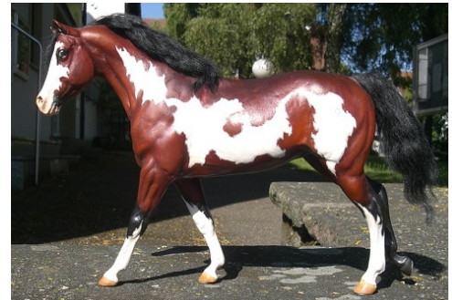
RESERVE CHAMPION PATTERNED COLOR: ROSALIA (RN)

Longear/Exotic (12): 1-Belle Kabong (AC), 2-So Molson Canadien (SSu), 3-J's Dandyion (AI), 4-Imagine That (ShR), 5-J's Tiger Lily (AI), 6-Gentleman John (BH), 7-O Karen (CV), 8-Gallimaufry (SSu), 9-Pam-mule-a (KW), 10-Sweet Adelaide (CV)