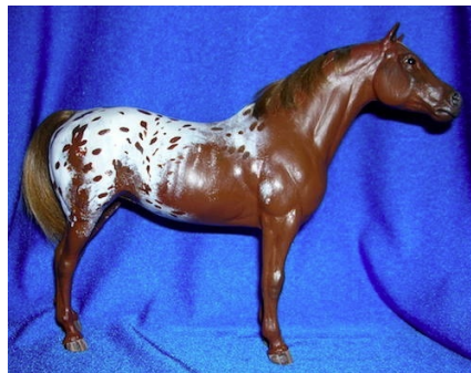
RESERVE CHAMPION PONY/MINI HORSE: LADY JESSICA (CV)