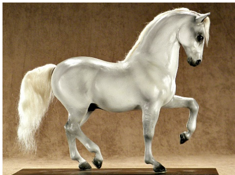
CHAMPION SPANISH BREED: KT SIGLAVY XI AFRICA (CM)

Other Pure/Mixed Spanish Breed (6): 1-KT Siglavy XI Africa (CM), 2-Maestoso Pavlova (SSSt), 3-Pavlova (SSSt), 4-Ima Believer (CR), 5-Pampapaul IV (JV), 6-TS Alluvame Sunspots (MP)