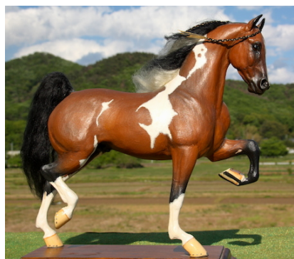
RES. CHAMPION EXTREME REMAKE/REPAINT/HAIR OR SCULPTED M/T: YELLOW DANCER (AC)

[Judge's comment: This was the hardest decision yet. Be proud of your extremes!]