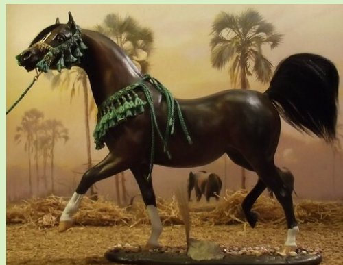
Gwalizein 30 Years Old!

(Have one created in 1962, 1967, 1972, 1977, 1982, 1987, 1992, or 1997? Get it into the Birthday Barn spotlight by e-mailing its photo and info to our Gmail address below!)