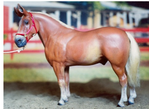
CHAMPION LONGEAR/EXOTIC/FANTASY: JEB (SSu)

Fantasy Equine (4): 1-Hikaze (CV), 2-TS Ramoth Of Riell (MP), 3-TS Trueheart (CS), 4-Liyr (CV)