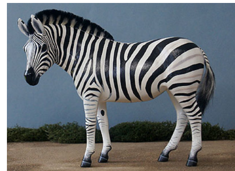
RESERVE CHAMPION LONGEAR/EXOTIC/FANTASY: PEGI SOO (CS)