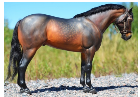
R. POCO LEO CHEX

"He is named after a real Belgian from the turn of the 19th century and is an ancestor of Congolaise, a famous Belgian stallion. His name translates from French to the English 'The Count of Monte Cristo,' the book by Alexandre Dumas. I was always taken with that story. So pleased other folks like him too!"