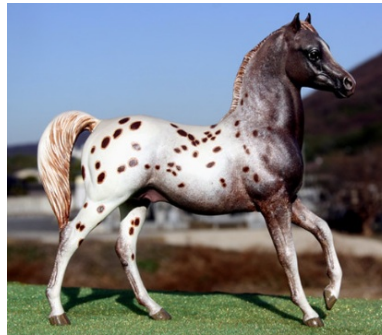
RESERVE CHAMPION REPAINT: TRANSMUTE CONDOR (AC)

Repaint w/Hair M/T: Trad. or Larger (24): 1-Dane Tyler Bennington (LoB), 2-Paisano (NF), 3-Plum Garden (AC), 4-Lakota Diamond (EH), 5-Lady Jessica (CV), 6-Maharajah (LaD), 7-Cayennes Cyette (SSu), 8-Cotton Jenny (JW), 9-Ibn Samekh (AP), 10-Red Eagles Snow Leopard (SSu), HM-Milwaukee Rascal (SSu)