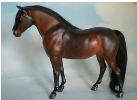
RES. CHAMPION SIMPLE REMAKE/REPAINT/HAIR OR SCULPTED MANE/TAIL: WAV BROWN BESS (LID)

Major Remake & Repaint w/Hair M/T: Trad. or Larger (100): 1-D.O. Sporting Chance (BH), 2-Leviton (JP), 3-Schneider (SSu), 4-Rebel Yell (RN), 5-Warlord (NF), 6-The Bluesmobile (AC), 7-TS Druid Allanon (MP), 8-Wildbeat Irongear (AC), 9-Special Print (RN), 10-LBR Rashasha (RN), HM-Plastique (SSu)