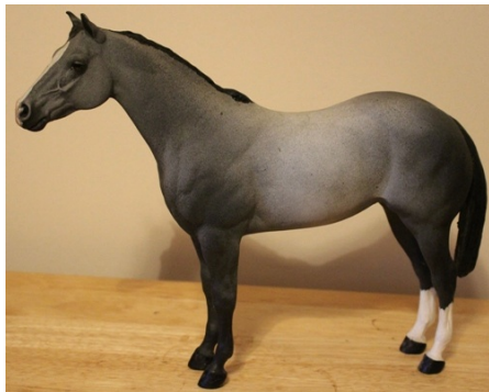
RESERVE CHAMPION STOCK: POCO GRAYBAR (LoB)

Arabian (28): 1-*The Raisuli (CH), 2-Plum