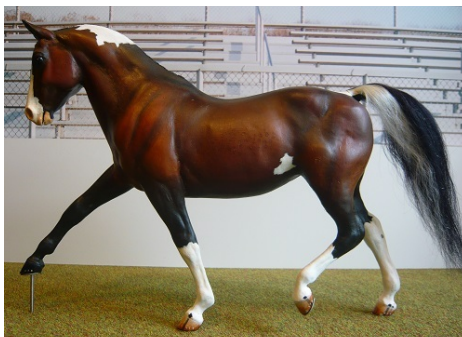
RES. CHAMPION SPORT BREED: CASTLEREA BLIND AMBITION (JV)

Paso Fino/Peruvian Paso (12): 1-Marquesa (CM), 2-Tesoro D Oro (JW), 3-Me Bolido El Pastor (JW), 4-D.O. Caballo Del Sol (AC), 5-PR Balenciago Brio (JV), 6-Huaricanga (KW), 7-LJ Abricotine Bleu (JV), 8-TS Crystal Conchita (MP), 9-TS Jalapeno (MP), 10-TD Kalife's DeeDee (LeB), HM-Noche Estrallado (SSt)