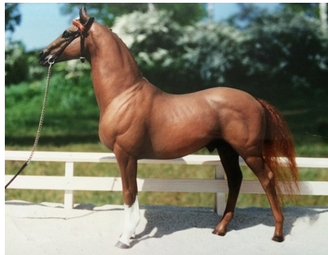
Stallions (7): 1-Sun's Oh Connor (SN), 2-Gold Dust (CC), 3-Ar Sayyed (SN), 4-Florentine (SSu), 5-Ebony & Ivory (CM), 6-Scimitar's Ebony Flame (CM), 7-Space Cowboy (SSu)

Gone But Not Forgotten: Vintage customs that no longer exist