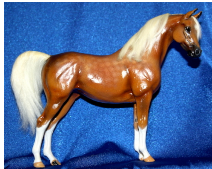
RESERVE CHAMPION CREAM/DUN COLOR: MY SPUTNIK BABY (CV)

Blanket Appaloosa (69): 1-Mighty Bright J (AI), 2-Bang Ippongi (AC), 3-Clash Game (AC), 4-Classy Chassis (SSu), 5-Murphy's Law (AP), 6-Red Ryder (CV), 7-Sunshine's Chocolate Dream (AI), 8-Rio Puerco (KW), 9-Mountain Man (SSu), 10-TS Adirondack (MP), HM-TS Vesuvius (MP)