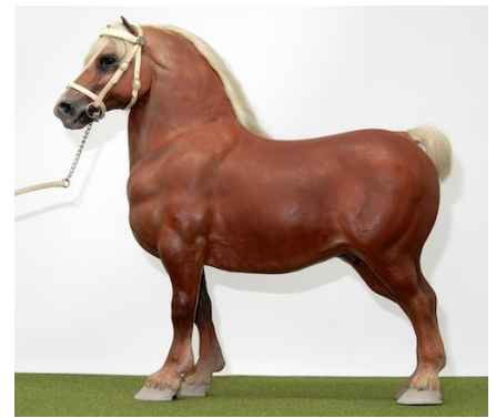
CHAMPION DRAFT: THE POWERFUL KATRINKA (AC) [at top of next column]

Other Pure or Mixed Draft Breed (10): 1-Galient (AC), 2-Matsuko DX (CV), 3-*So Viktor Alexi (SuR), 4-Simmerl (SN), 5-Tuff Enough (CC), 6-Nyx (AC), 7-Tetsugyu (AC), 8-Freudian Slip (AC), 9-Captain Lucky (CV), 10-BBG Uncle Al (CV)