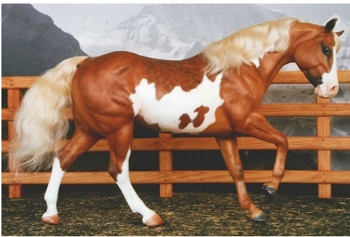
CHAMPION STOCK BREED: RUSTLER RIDGE (RN)

Other Pure or Mixed Sport Breed (12): 1-Sunshine's Hardcore Chocolate (AC), 2-Outlasting the Blues (AC), 3-Tug Hill By Design (CM), 4-Jersey Boots (BP), 5-The Mad Cookie (CV), 6-Cherokee Rose (JV), 7-DQ Konocit's Jet (CV), 8-TS Fire on the Mountain (MP), 9-Blank Stare (ShR), 10-Bag Lady (LK), HM-Blood Music (CV)