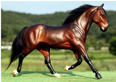
CHAMPION SPORT BREED: NIATROSS (AC)

Other Pure or Mix Sport Breeds (30): 1-PR Rosie O'Grady (JV), 2-The Bluesmobile (AC), 3-Solid Citizen (CM), 4-PR Murphy Brown (JV), 5-CL Thunder Rolls (HC), 6-Nafzieger (BR), 7-Ballidair (AC), 8-Jigen (AC), 9-Mr. Darcy (SN), 10-Mickey Scymon (AC), HM-Parklane Oystercatcher (JV)