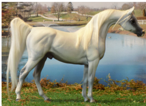
CHAMP MAJOR REMAKE/REPAINT/HAIR OR SCULPTED MANE/TAIL: KAS DREAM DANCER (BH)

Major Remake & Repaint w/Non-Hair M/T: Smaller than Classic (13): 1-In Lieu of Cartier (BR), 2-WBP Jolly Roger (LeB), 3-Moonlight Cocktail (CV), 4-Cast Iron Slew (AI), 5-Knight of the Zodiac (CV), 6-Lykke (AC), 7-Vijelie Noptii (BR), 8-Northern Exposure (BR), 9-Ridley (LK), 10-Strange Meadowlark (AC), HM-Majestic Ziggy (AL)