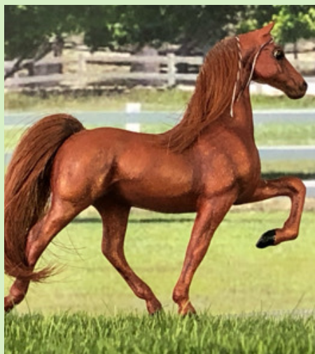
Crimson Queen 40 Years Old!