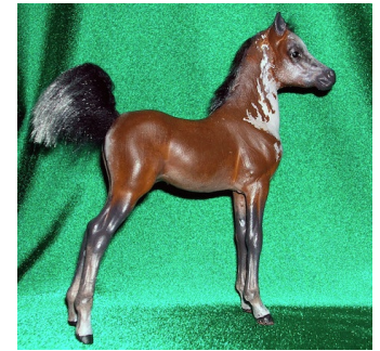
RES. CHAMPION FOAL: MELULU (CV)

1960s/'70s BREED DIV. OVERALL CHAMPION: *THE RAISULI (CH)