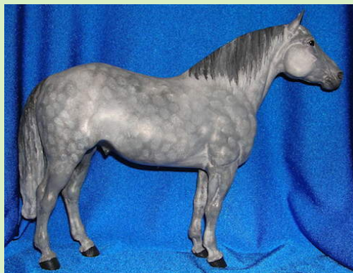
Speedy Gonzales 45 Years Old!