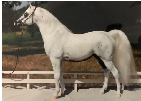
Mares (10): 1-Wahaana (SN), 2-Sun's Only For You (SN), 3-DQ Shiaway Jetta (CM), 4-Romanadvorlundar (SSu), 5-The Iron Madam (IC), 6-Ar Tayet (SN), 7-Lonesome Dove (CM), 8-Nayef (SN), 9-Sherwood Peacock (CM), 10-Lady Glade (IC)