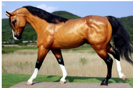
CHAMPION CREAM/DUN COLOR: POWDER RIVER (AC)

Dun/Grulla (15): 1-Seven S Rebel (LoB), 2-Miss Smokum Royal (CM), 3-Althea (ShR), 4-Confederate Gray (LoB), 5-Desert Medallion (RN), 6-Buttercup (NF), 7-Kid's Spanish Cash (CM), 8-My Sweet William (AI), 9-No Doubt (CV), 10-Zona Lee (CV), HM-Little Smoky (CF)