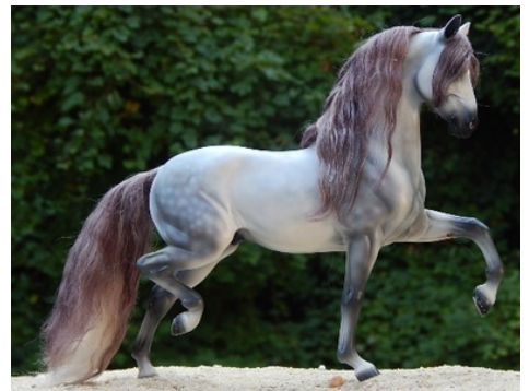
RES. CHAMPION SPANISH BREED: LEVITON (JP)

American Saddlebred (19): 1-Operation Meteor (AC), 2-TS Missy Brown (MP), 3-Highlands Captain Jack (VF), 4-High Society (KK), 5-All Eyes On Me (CV), 6-TS Autumn Dancer (MP), 7-Capital Genius (HC), 8-20th Century Fox (VM), 9-Sultan of Swing (JC), 10-Divine Miss M (CR), HM-TS Cenozoic Silver Morning Glory (MP)