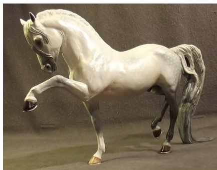
RES. CHAMPION MAJOR REMAKE/REPAINT/HAIR OR SCULPTED MANE/