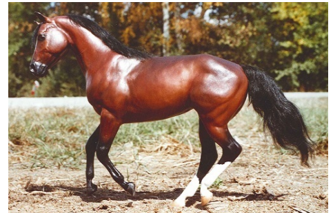
CHAMPION SPORT BREED: RHEINGOLD (RN)