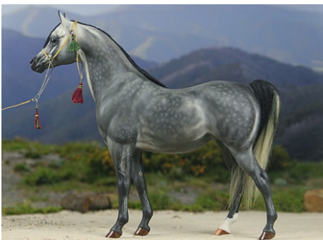
RESERVE CHAMPION LIGHT BREED: MON'NAFA RANI (CR)