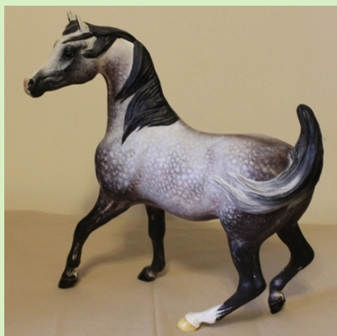
Arahael 35 Years Old!