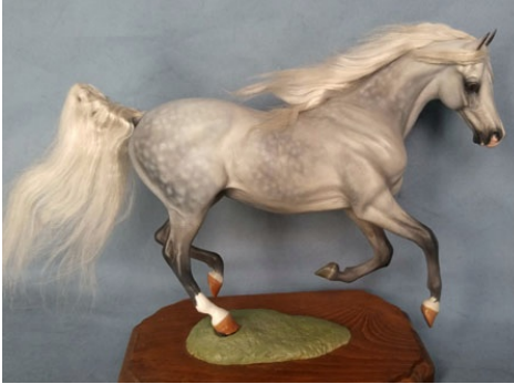
CHAMPION LIGHT BREED: GOSSAMER WINGS (KW)

Other Pure or Mixed Light Breed (9): 1-TS Desert American Queen (MP), 2-KT Bunduki (RN), 3-Meditation (KK), 4-WBP Abrianna (LeB), 5-Carolina Girl (SSt), 6-PR Malika Siglavia (JV), 7-LJ Hit It Hal (SM), 8-Dream Theater (ShR), 9-Red Hawk (SSt)