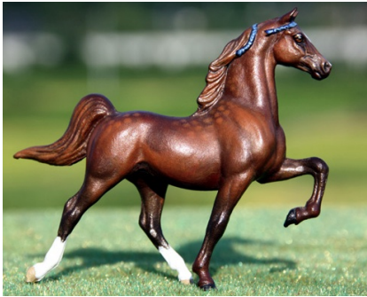
RESERVE CHAMPION GAITED BREED: STARSHIP PHOENIX (AC)