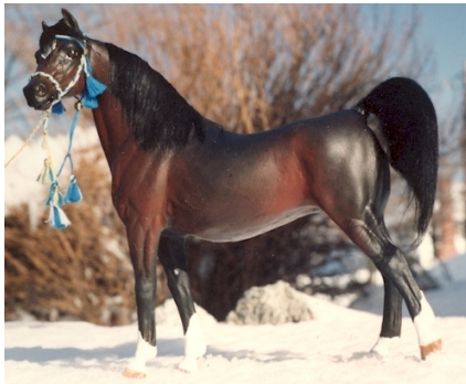
RESERVE CHAMPION LIGHT BREED: TS DESERT AMERICAN QUEEN (MP)

Thoroughbred (43): 1-Brimstone (JC), 2-Nitronix (CV), 3-Highwayinthewind (AC), 4-Master Derby (AC), 5-Waltzing Matilda (AC), 6-In the Dark (ShR), 7-DA Ben Macdui (JV), 8-Claudia (SN), 9-Indian Pride (KO), 10-KA Flight of Fancy (JV), HM-Elite Colors (CV)