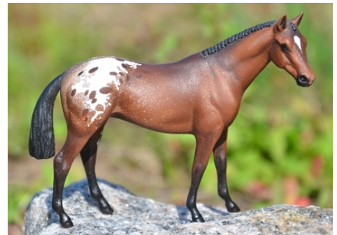
RESERVE CHAMPION REPAINT/HAIR OR SCULPTED MANE/TAIL: I'M IMPRESSED (SN)

Repaint w/Non-Hair M/T: Smaller than Classic (10): 1-I'm Impressed (SN), 2-Romeo (CR), 3-Harmonium (LK), 4-Kitty Sonata (IC), 5-Bint Amira (CV), 6-Titan (IC), 7-Frosted Gold (CR), 8-London Fog (LK), 9-CL Fairway (HC), 10-Tiny Bud (HC)