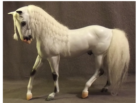
CHAMPION SPANISH BREED: GS SOLITUDE (JW)

Other Pure or Mixed Spanish Breed (11): 1-Siglavy Seiko (CV), 2-PR Bosanova Brief Encounter (JV), 3-RM Sophiia (CV), 4-Elusive Vision (SSt), 5-Ice Queen (AI), 6-Encaje (SSt), 7-Malegena (CM), 8-Estela (VM), 9-KT Danza De Oura (CM), 10-TS Picante (MP), HM-Gateado Mancho (AC)