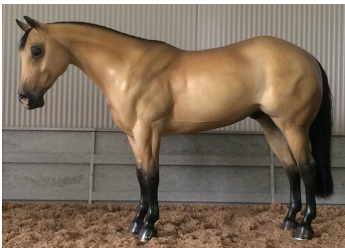
CHAMPION SIMPLE REMAKE/REPAINT/HAIR OR SCULPTED MANE/TAIL: JEMEZ ANTIGUA *ShR

Simple Remake & Repaint with Non-Hair M/T: Smaller than Classic (10): 1-WBP Frostybiters (LeB), 2-Ice Queen (AI), 3-Meghan's Hope (SSSt), 4-Shales Sassy Miss (IC), 5-Skip Mount (RN), 6-ZI Jedi Jetta (AI), 7-McQueen (LK), 8-Ziggy (HC), 9-Star at Rest (AI), 10-Marlayna (ShR)