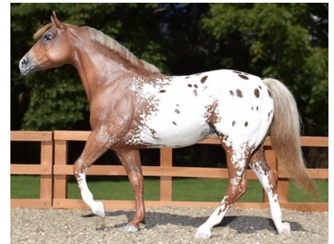
CHAMPION PATTERNED COLOR: MIGHTY BRIGHT J (AI)

Other Pinto Patterns (88): 1-Rosalia (RN), 2-RM Heiwa (AC), 3-Seiya (AC), 4-Starzans (AC), 5-Peppy Playboy (CS), 6-Targa Carrera (AC), 7-Ruby Heart (CF), 8-Risque Business (KW), 9-Little Bit Bar (SSu), 10-Indigo Eyes (AC), HM-Pampapaul IV (JV)