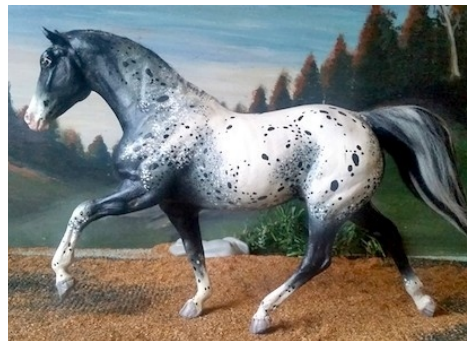
RES. CHAMPION GAITED BREED: AMB MIDNIGHT FROSTY (AC)

Clydesdale/Shire (18): 1-Thunder in Paradise (AC), 2-Foxcroft Lad (LK), 3-Diamond Blue Rose (CR), 4-Brigante (AC), 5-Cedar Hill Duncan (VM), 6-Dominion Blue Douglas (SSu), 7-Royal Witch (AP), 8-Sparrowwood Beauty (SSu), 9-Castlekeep Mistress (LoB), 10-Hylands Cavalier (AL), HM-Lady of Trieste (CM)