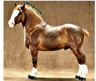
LE COMTE DE MONTE CRISTO