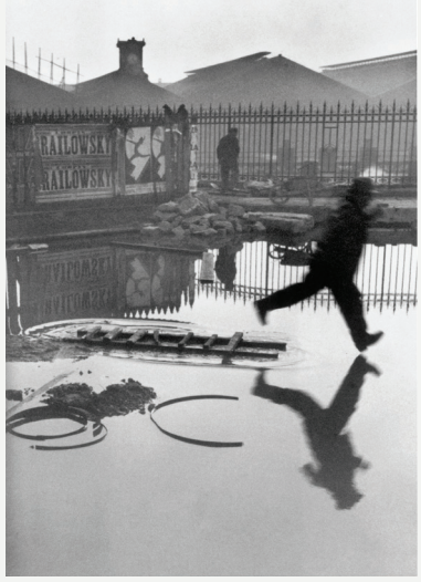
Henri Cartier-Bresson Retrospective at the Pompidou Centre, Paris