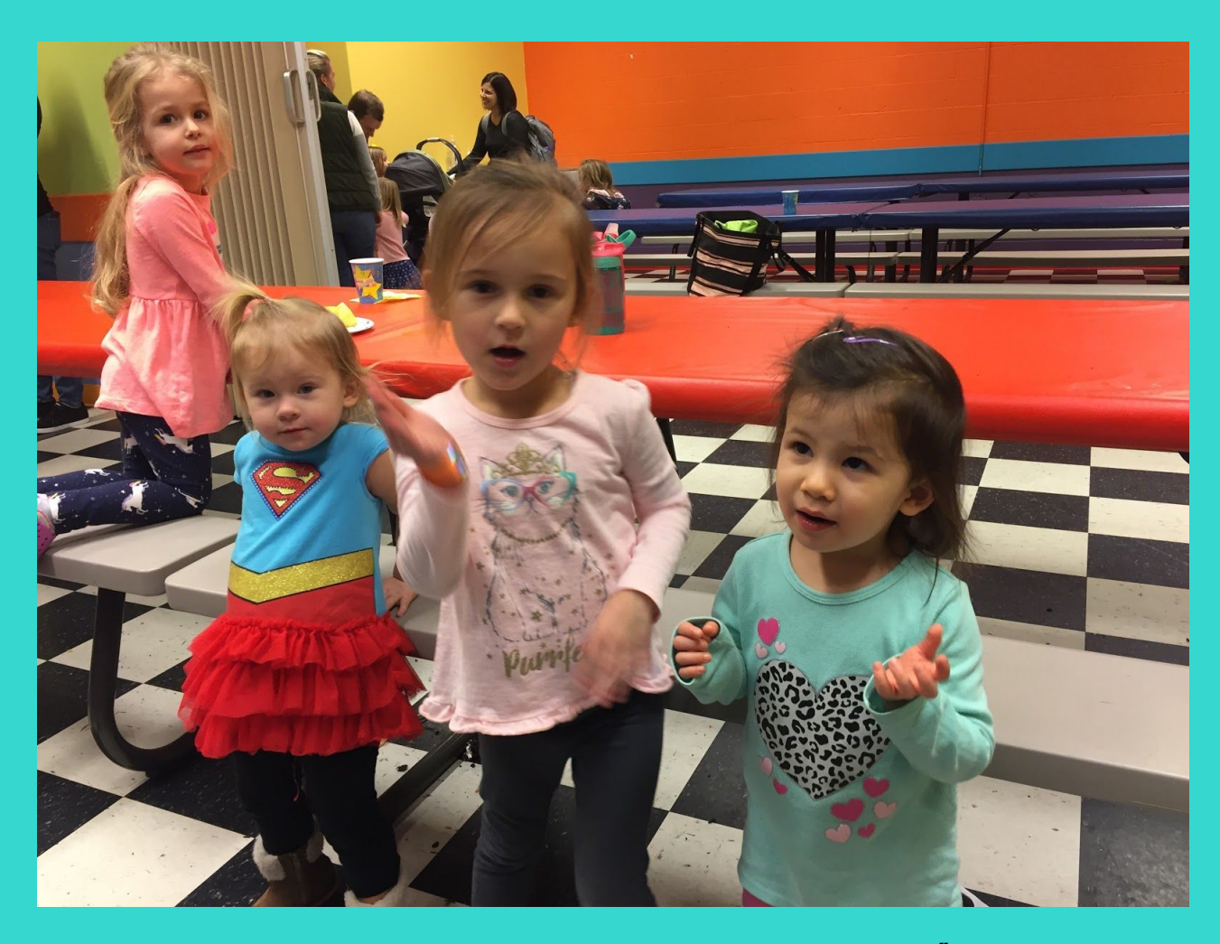
What a great way to kick off the new year!